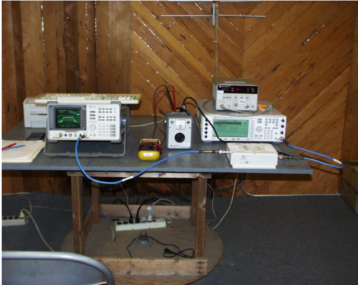
FREQUENCY VS. VOLTAGE