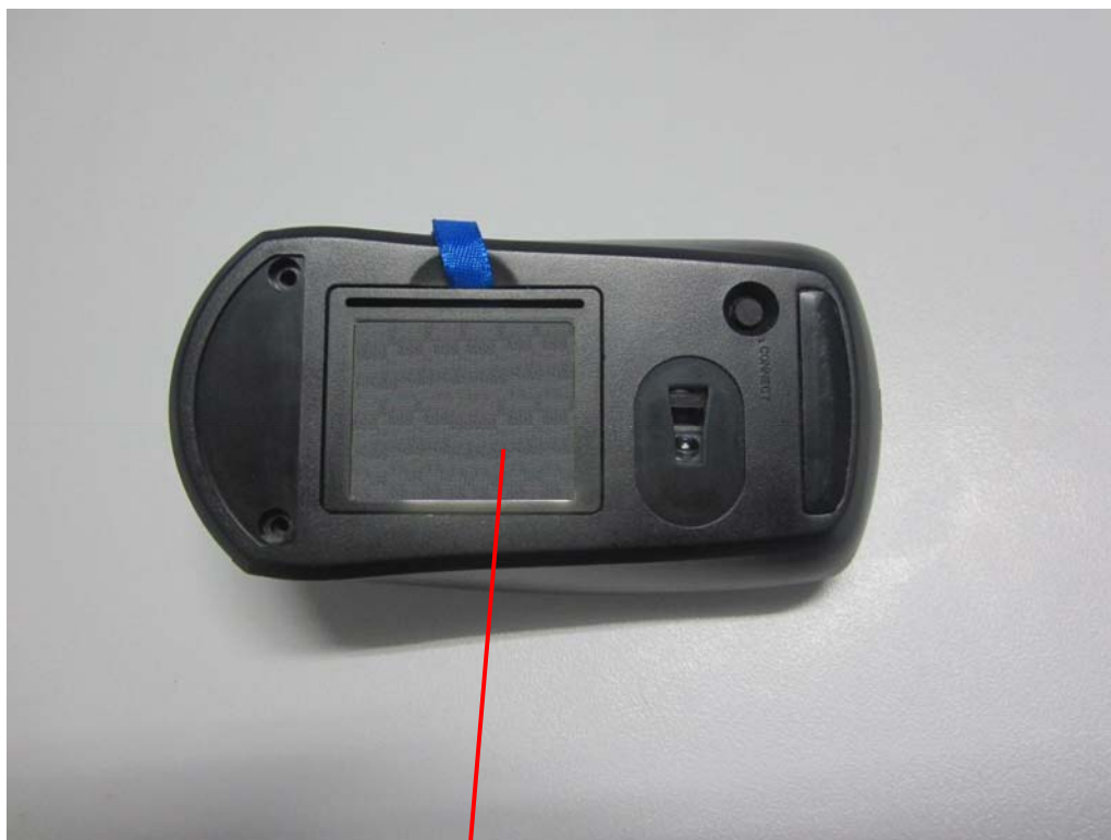
Label Part 2