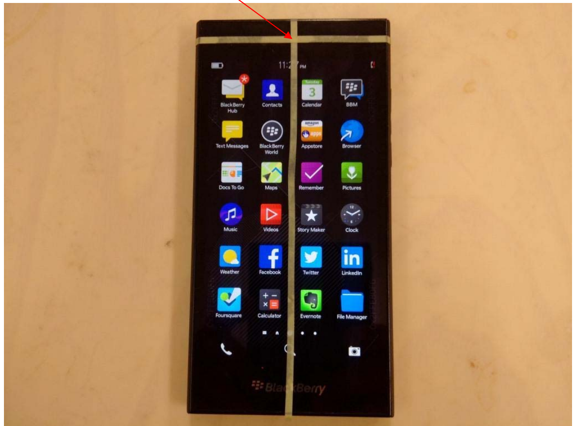
Figure C1. BlackBerry Smartphone