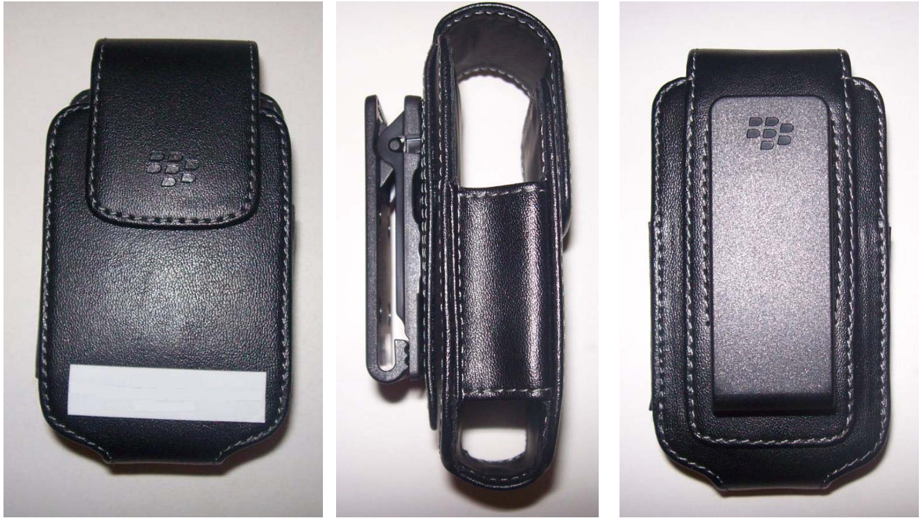
Figure E3. Body worn holster