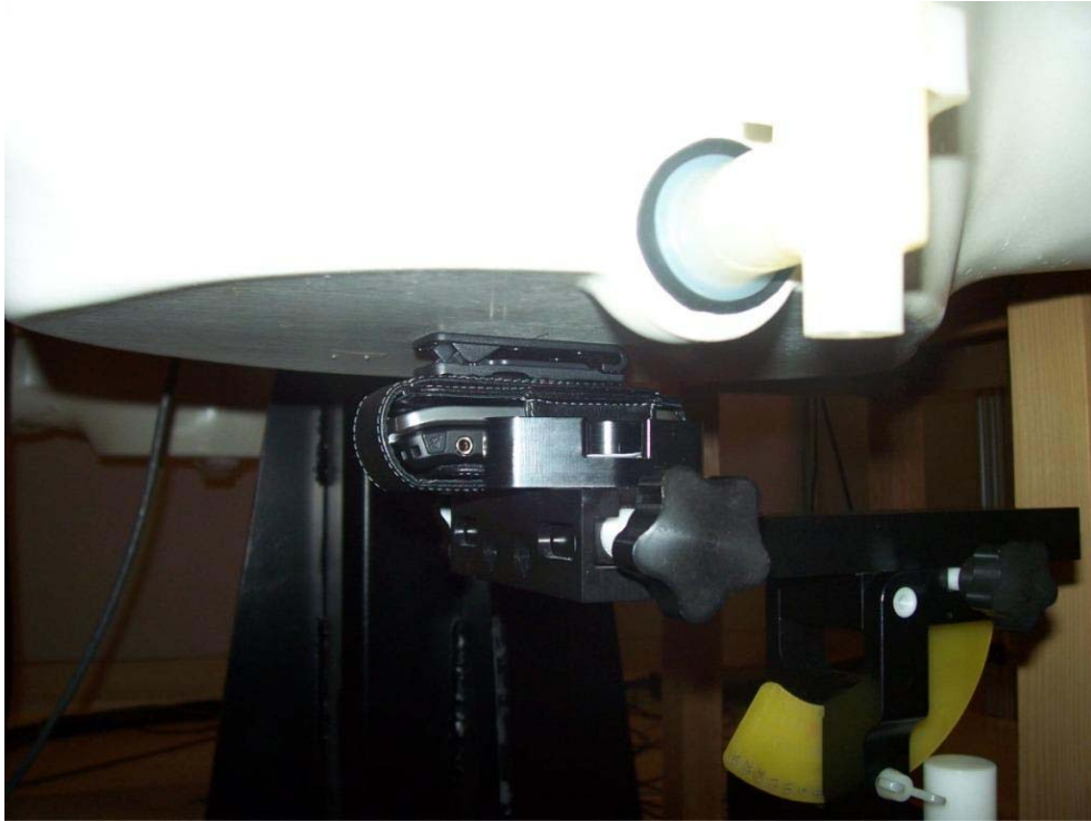
Figure E8. Body-worn configuration ( Holster 1, front facing phantom)