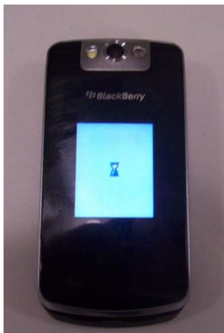
Figure E2. BlackBerry Smartphone – Flip Closed