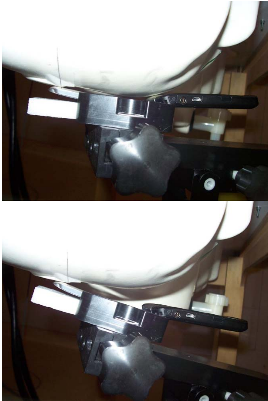
Figure E4. Head configuration (Right Touch/Tilt)