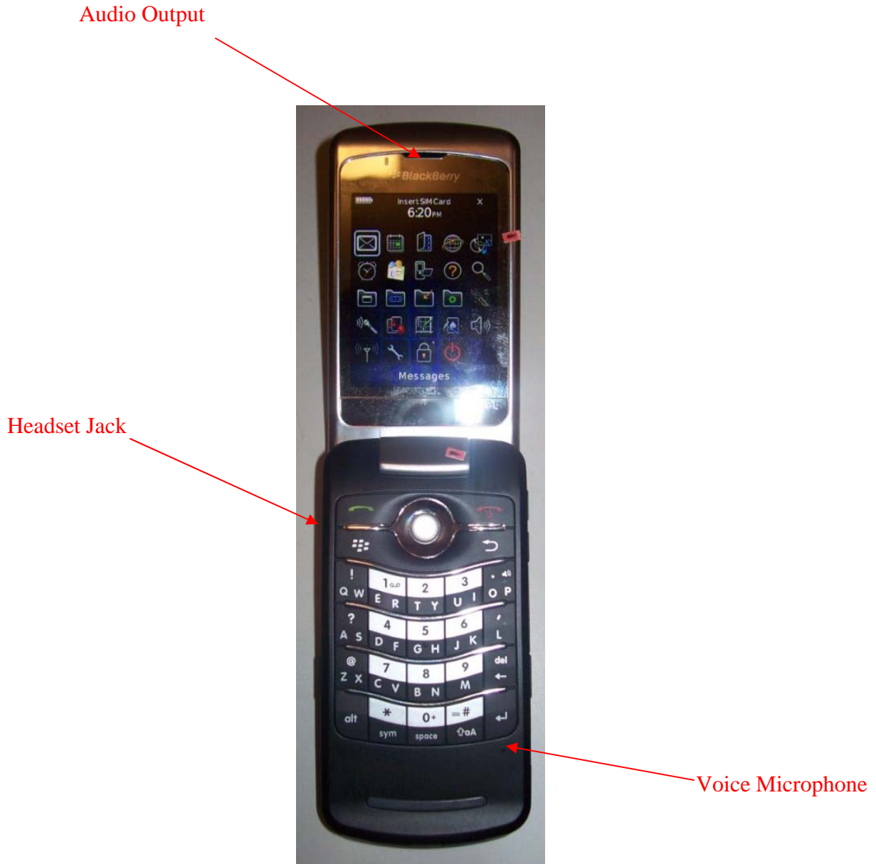
Figure E1. BlackBerry Smartphone – Flip Open