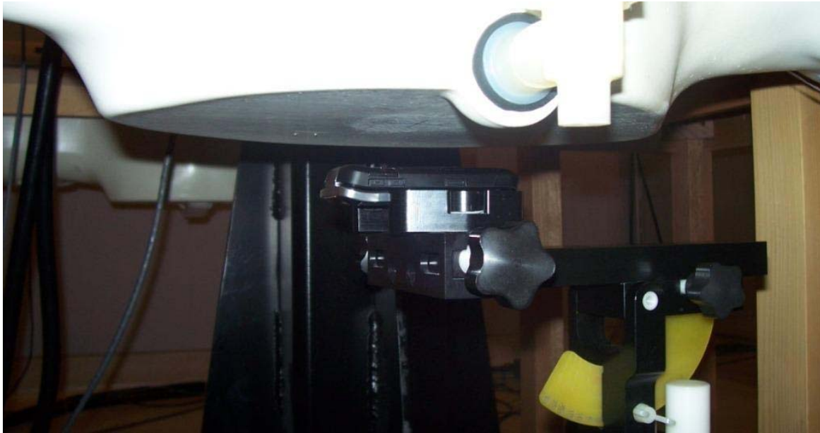
Figure E10. Body-worn configuration (No Holster, 25 mm away, back facing phantom)