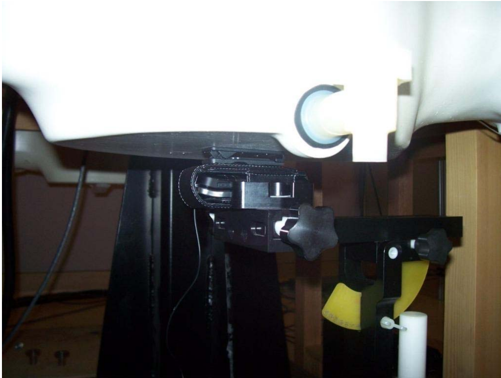
Figure E9. Body-worn configuration (Holster 1, headset, back facing phantom)