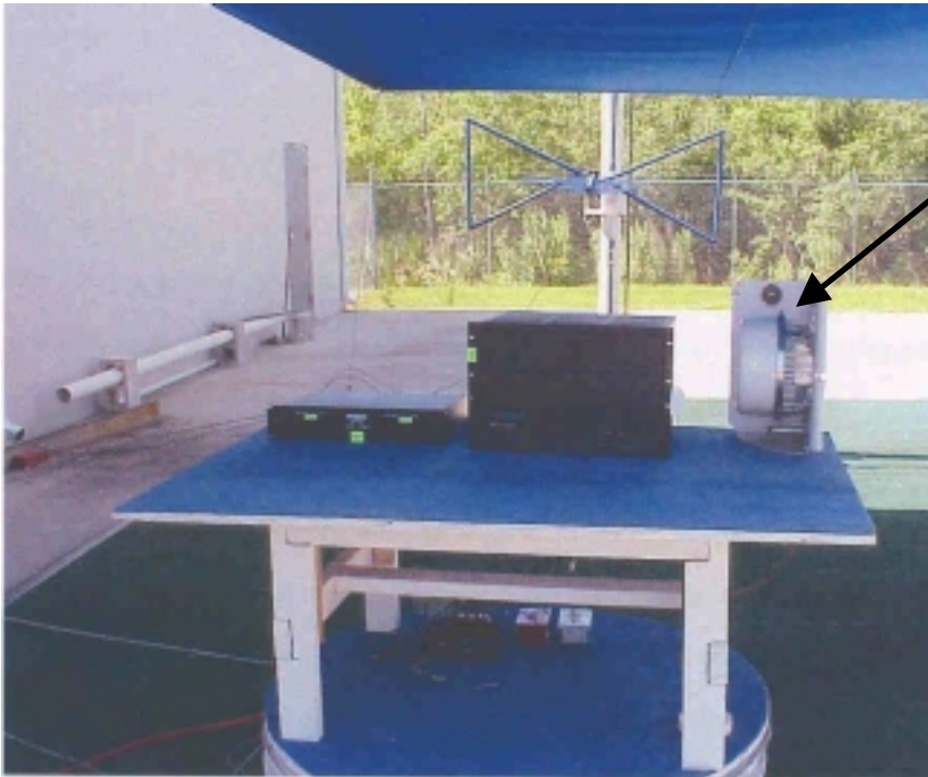
Sector ODU and Antenna