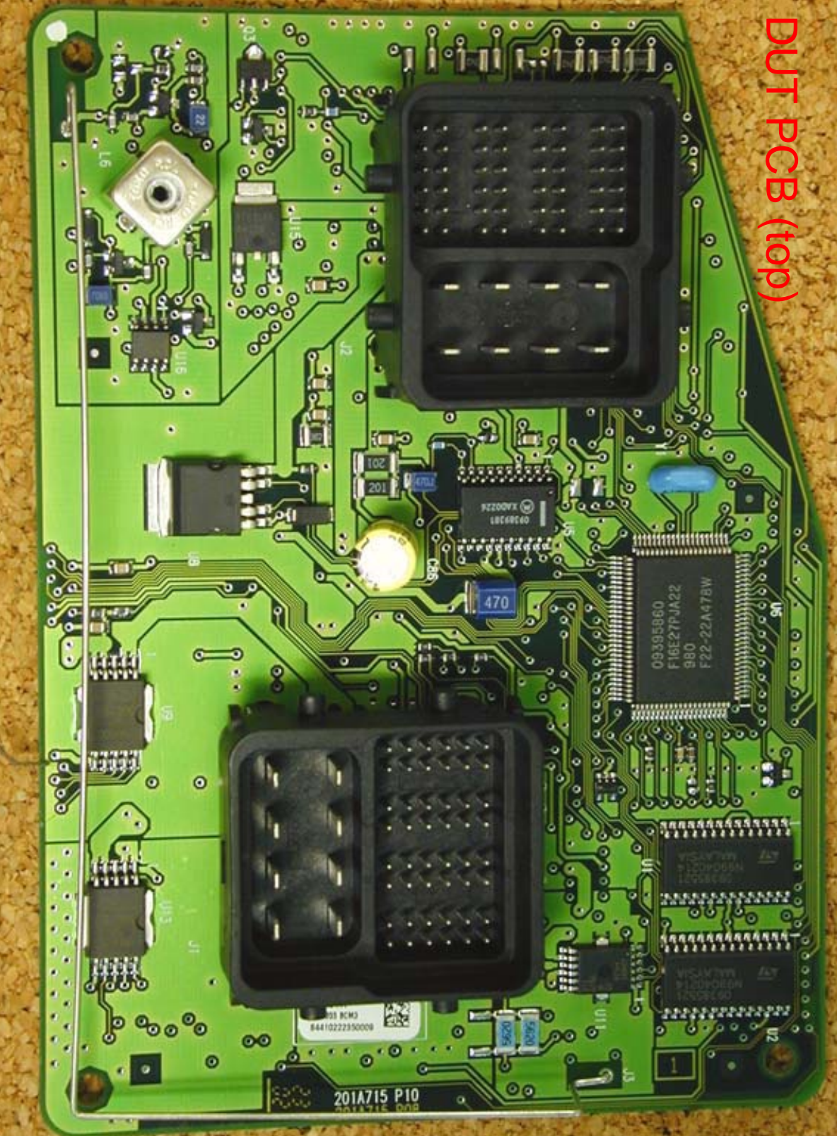
DUT PCB (top)