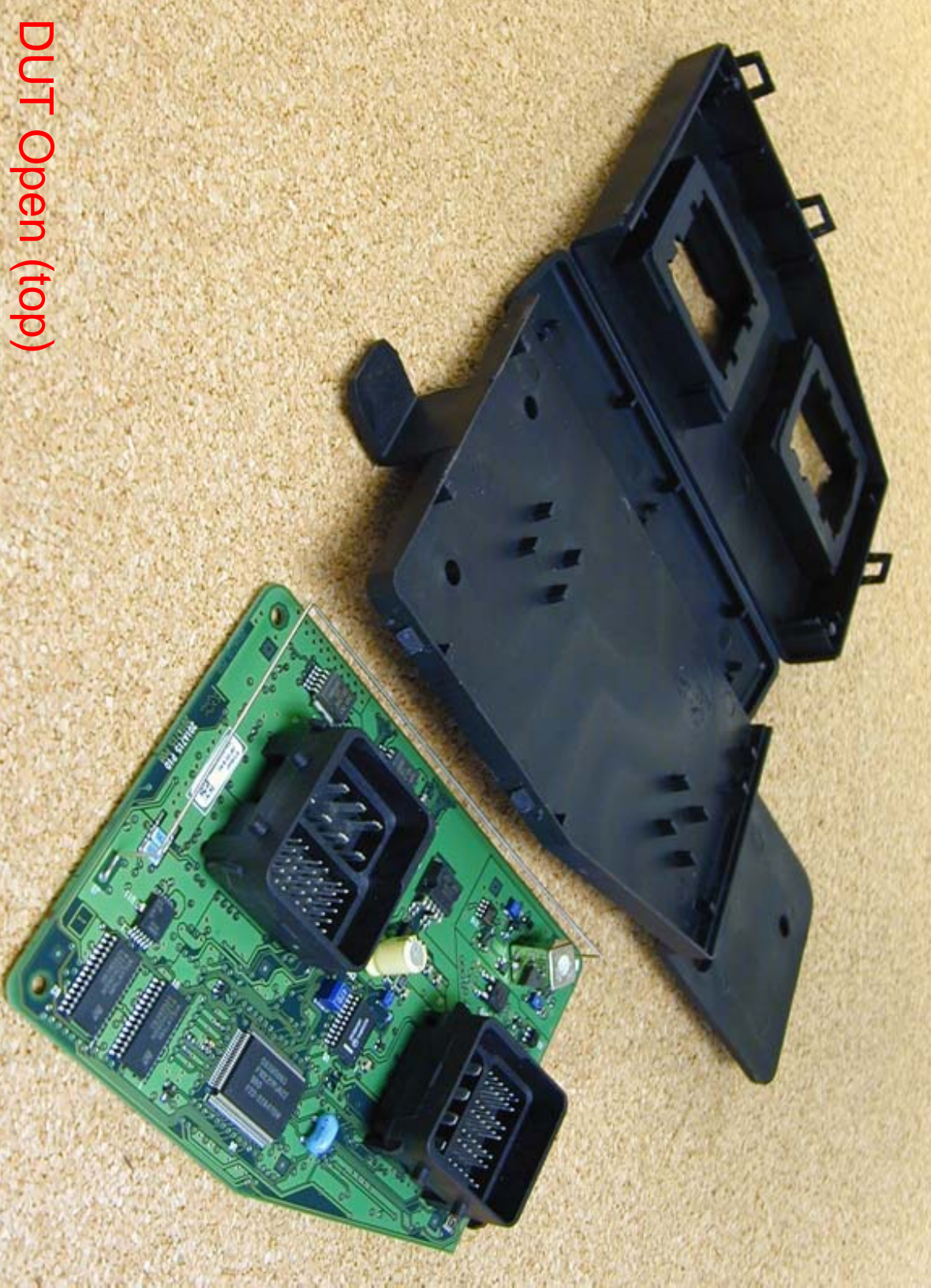
DUT Open (top)