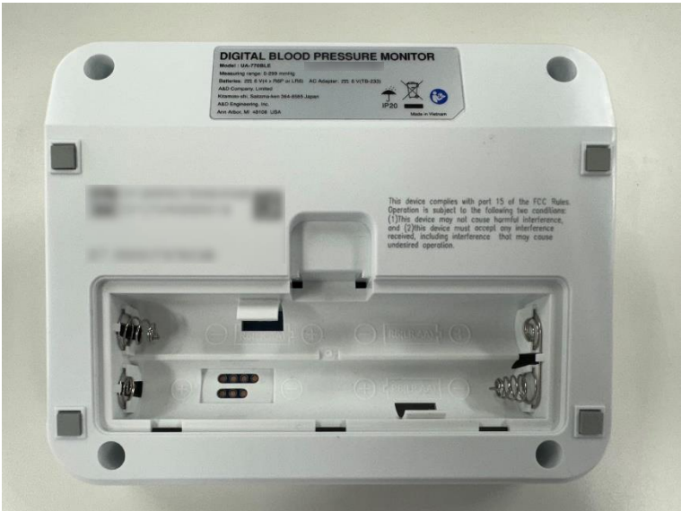
Open Battery Cover