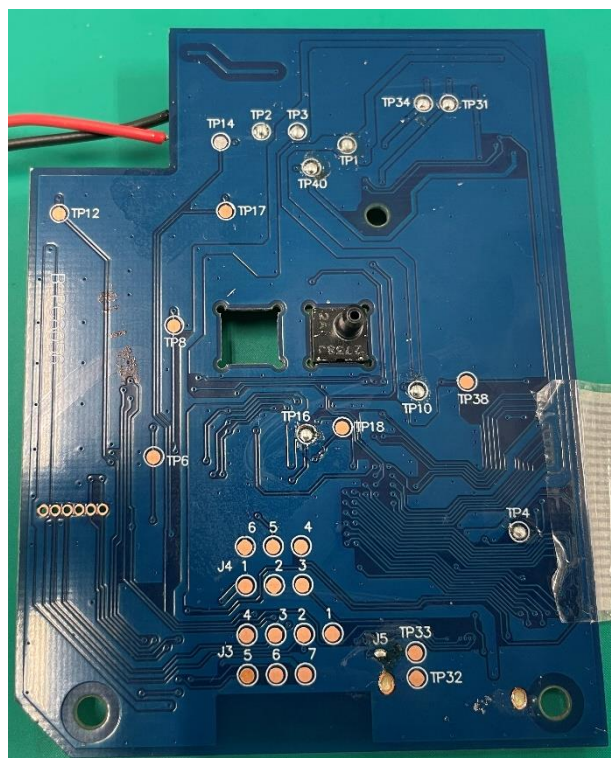
back of Board