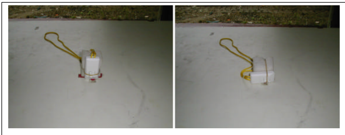
Radiated Open Site Test Set-up