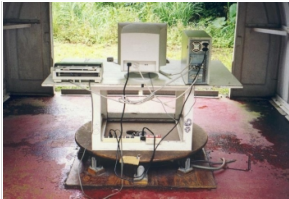
Radiated Emission Setup Photos (Worst Emission Position)