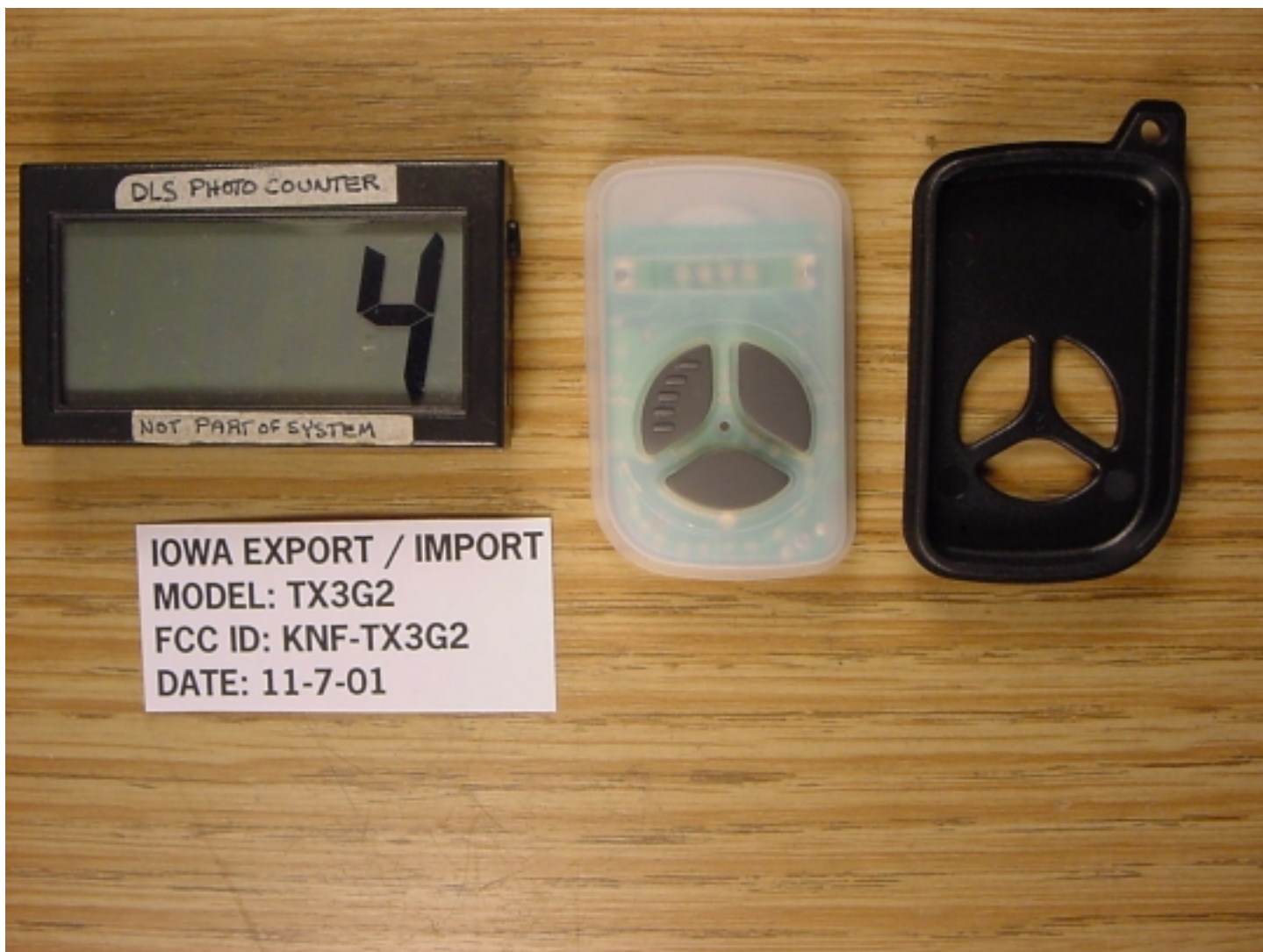
Front Cover Removed