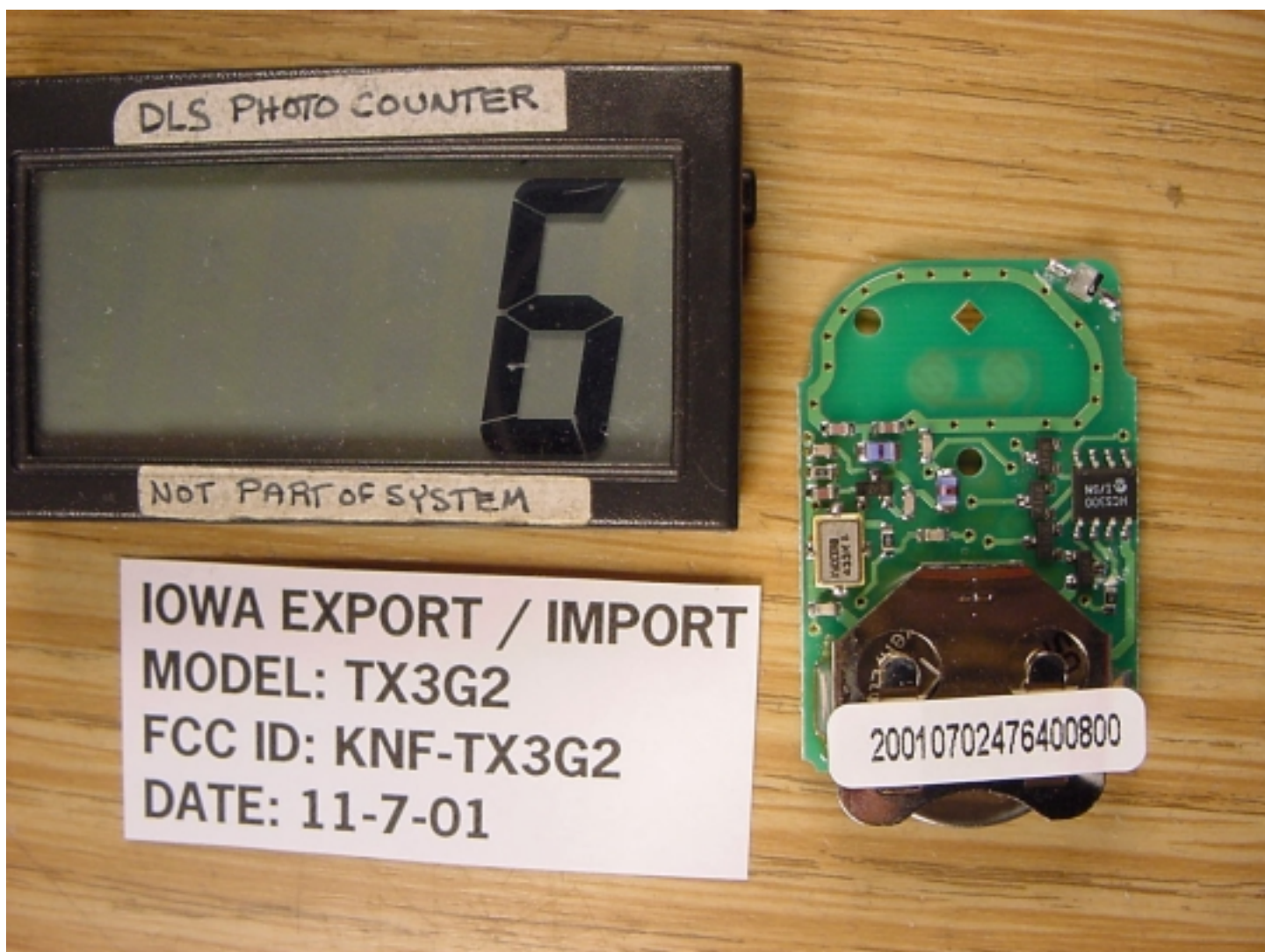
Circuit Board Component Side