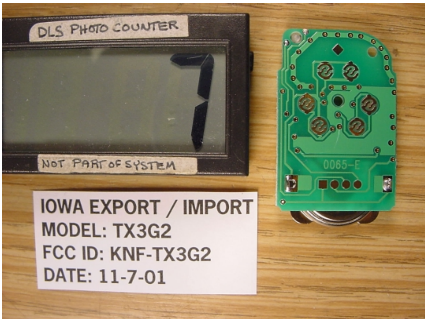
Circuit Board Button Side