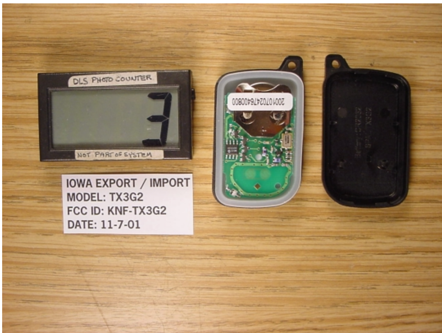
Back Cover Removed