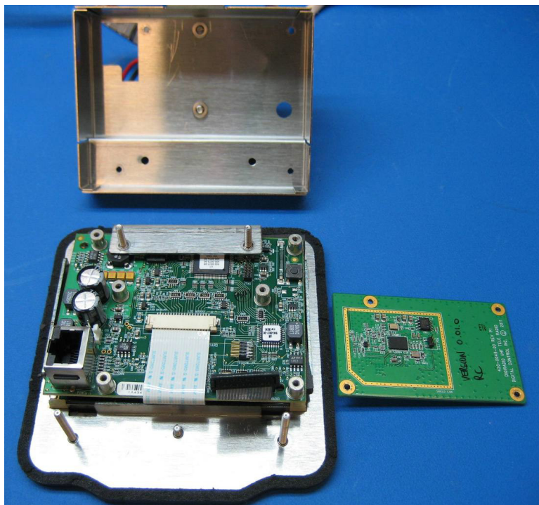
Display module shown with DigiRadio removed (showing underside)