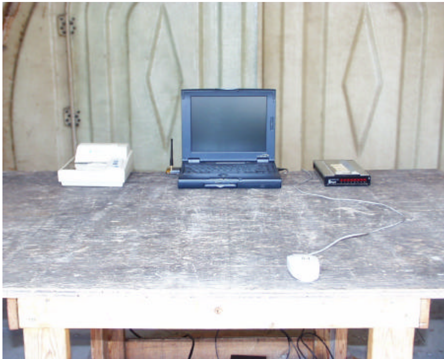
Radiated Emission below 1 GHz measurement