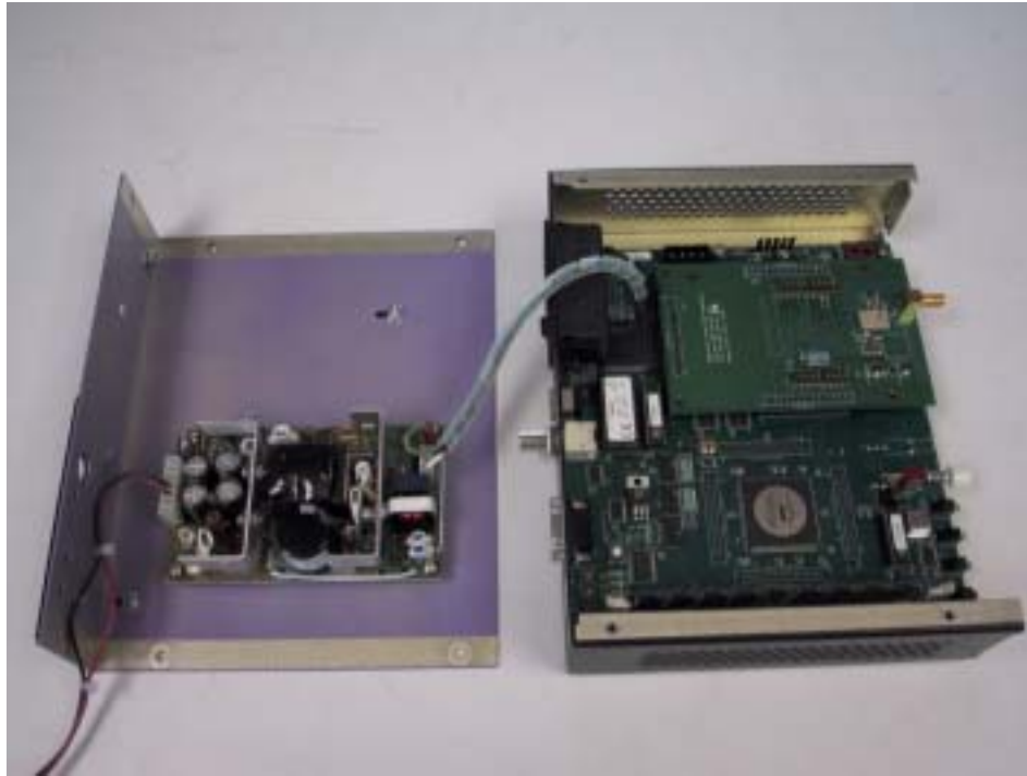
Chassis Cover Removed