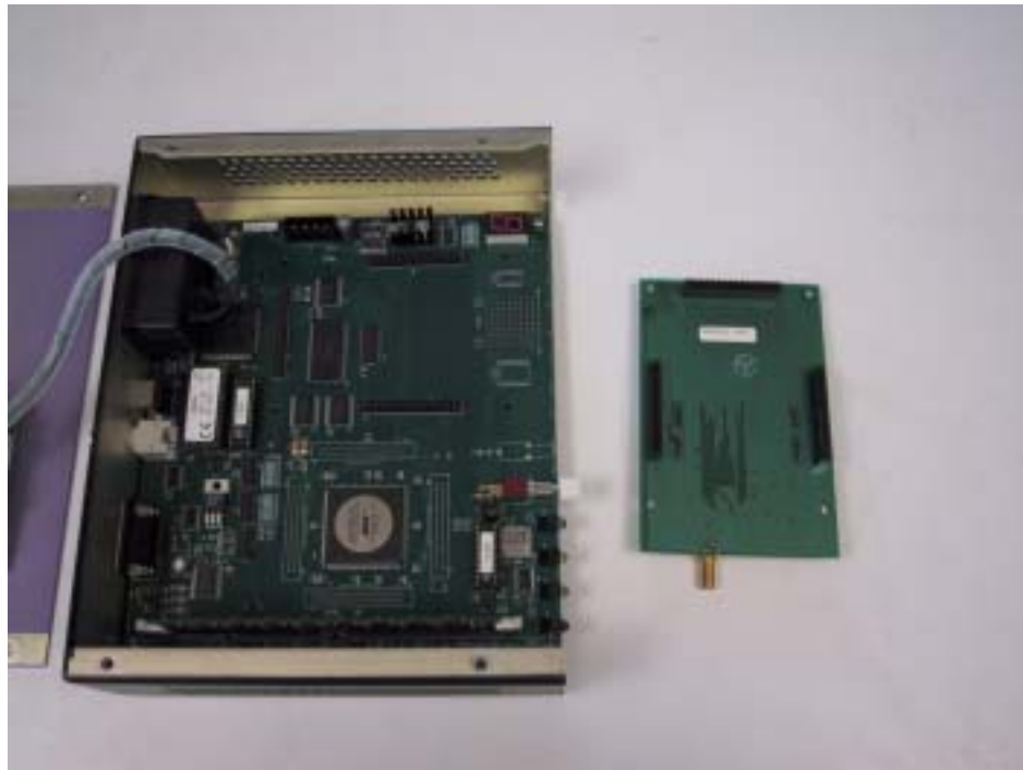
Radio Module PCB – Bottom View / Main PCB – Top View