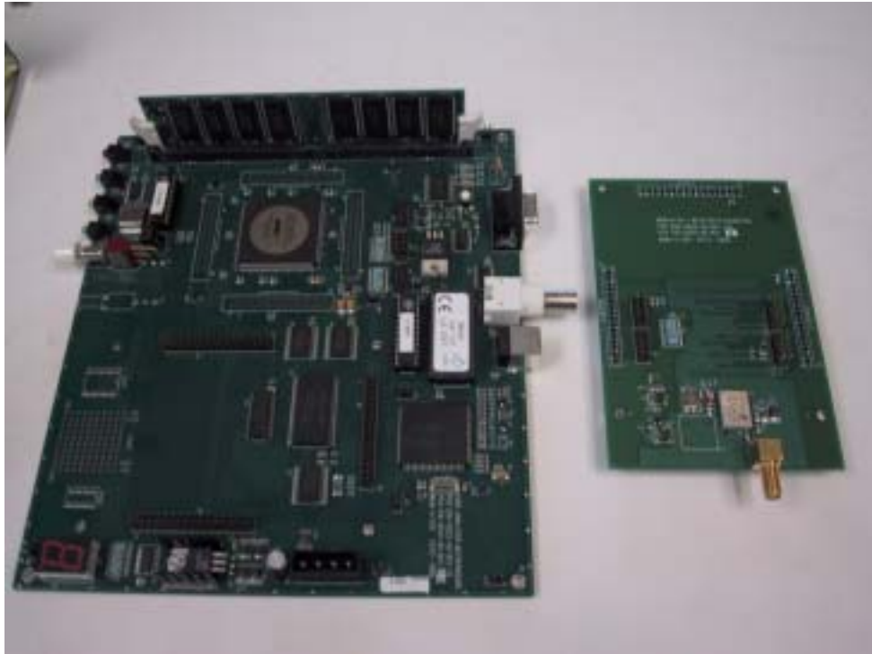
Main PCB / Radio PCB – Top View