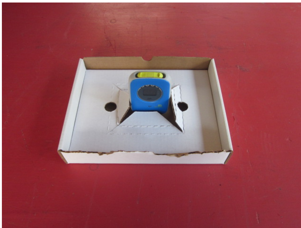
Test Setup, Fundamental and Spurious Emissions, Configuration X