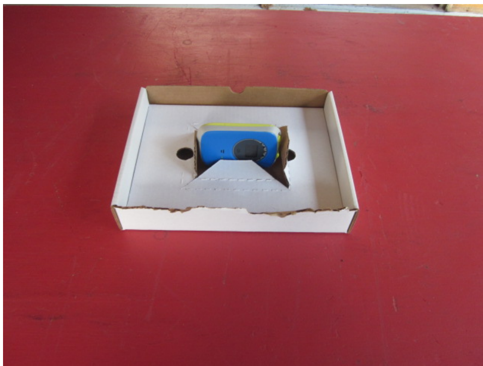
Test Setup, Fundamental and Spurious Emissions, Configuration Y