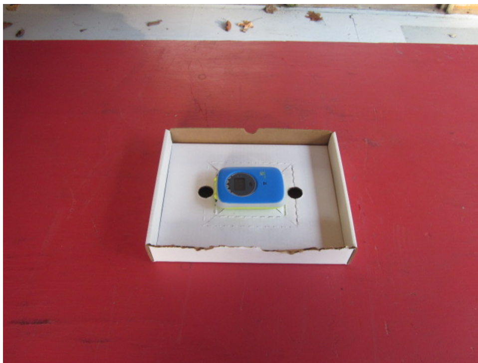
Test Setup, Fundamental and Spurious Emissions, Configuration Z