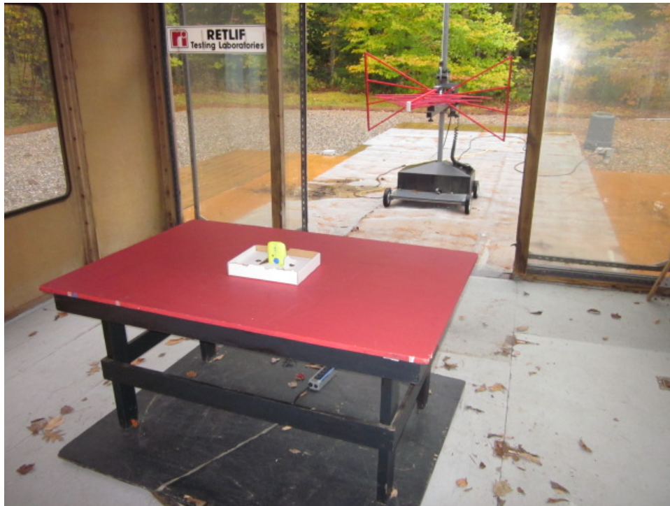
Test Setup, Horizontal Antenna Polarization, 30 MHz to 1 GHz