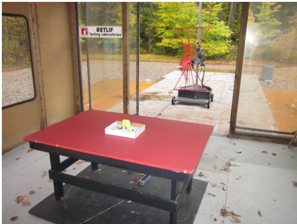
Test Setup, Vertical Antenna Polarization, 30 MHz to 1 GHz