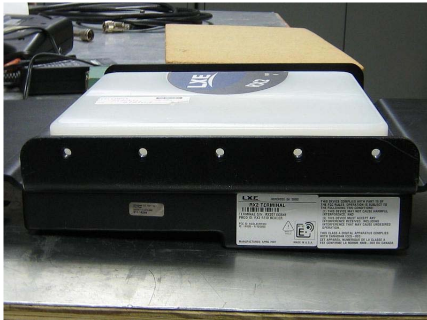
FCC ID – IC – Model Number FCC Statements