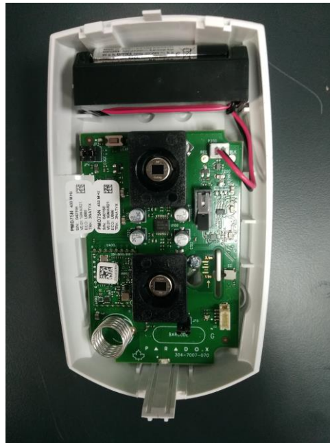
Photograph No.1 Internal view