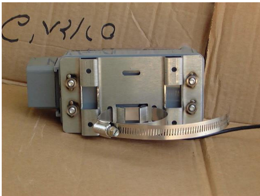
Figure 3 Rear View