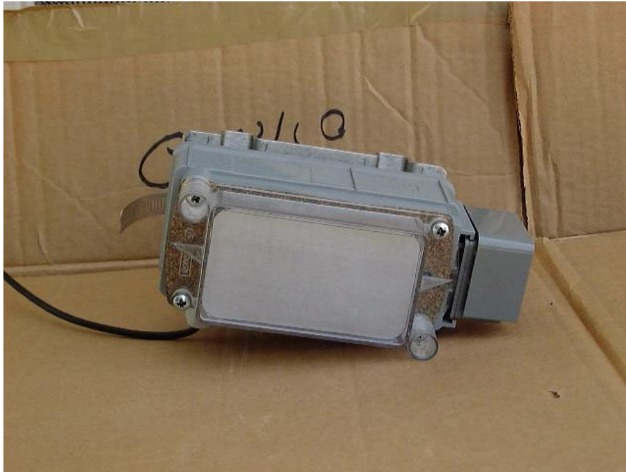
Figure 1 Front View With Cover