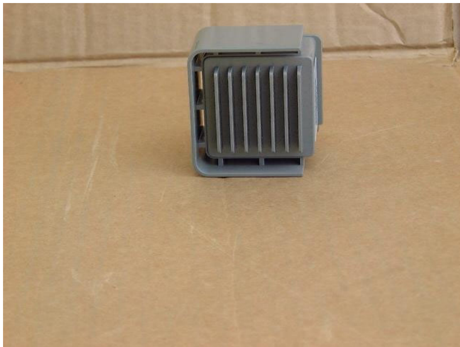
Figure 5 Battery Side 1