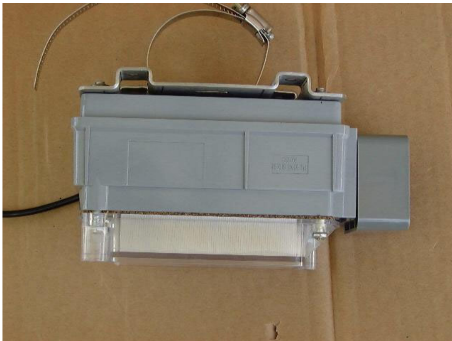
Figure 2 Top View