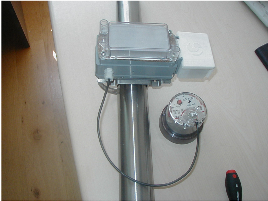
Figure 7 General View