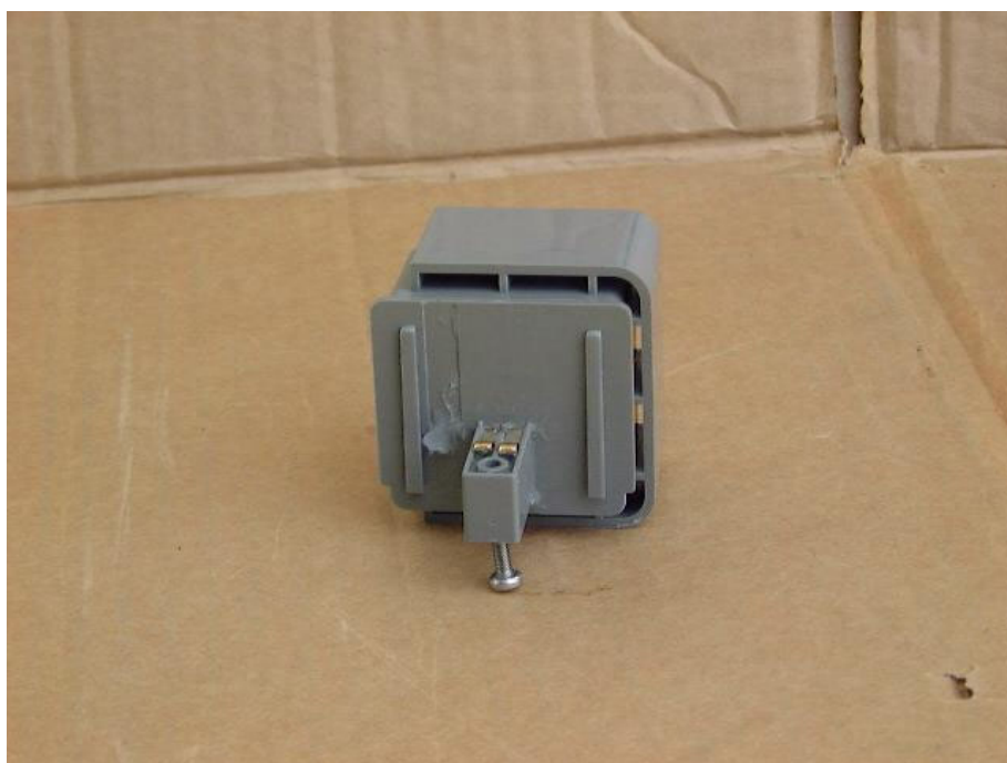
Figure 6 Battery Side 2