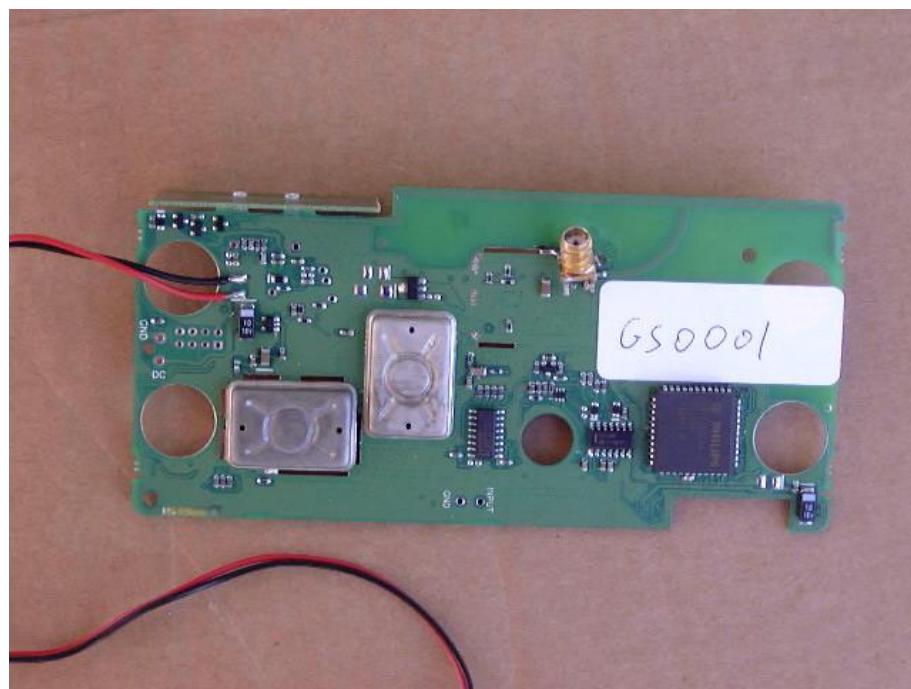
Figure 3 PCB Side 1