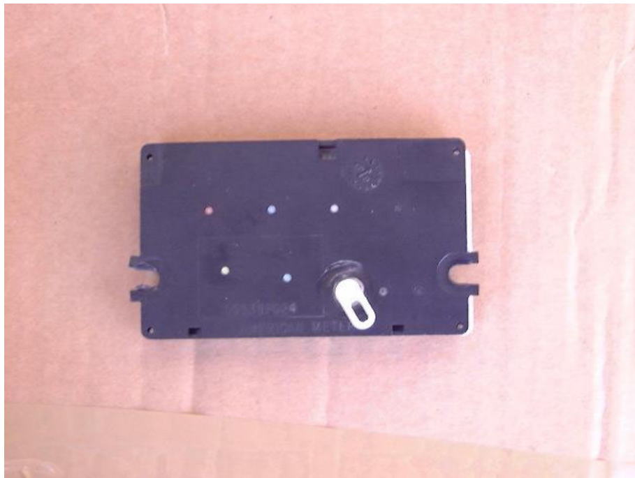
Figure 2 Front Panel Rear View