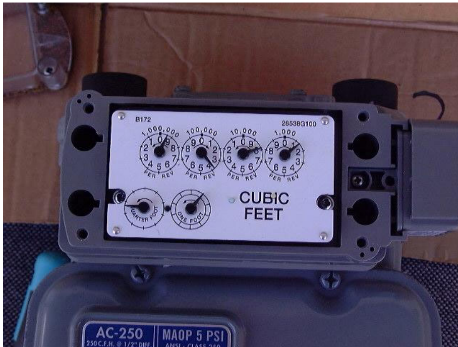
Figure 1 Front View Without Cover