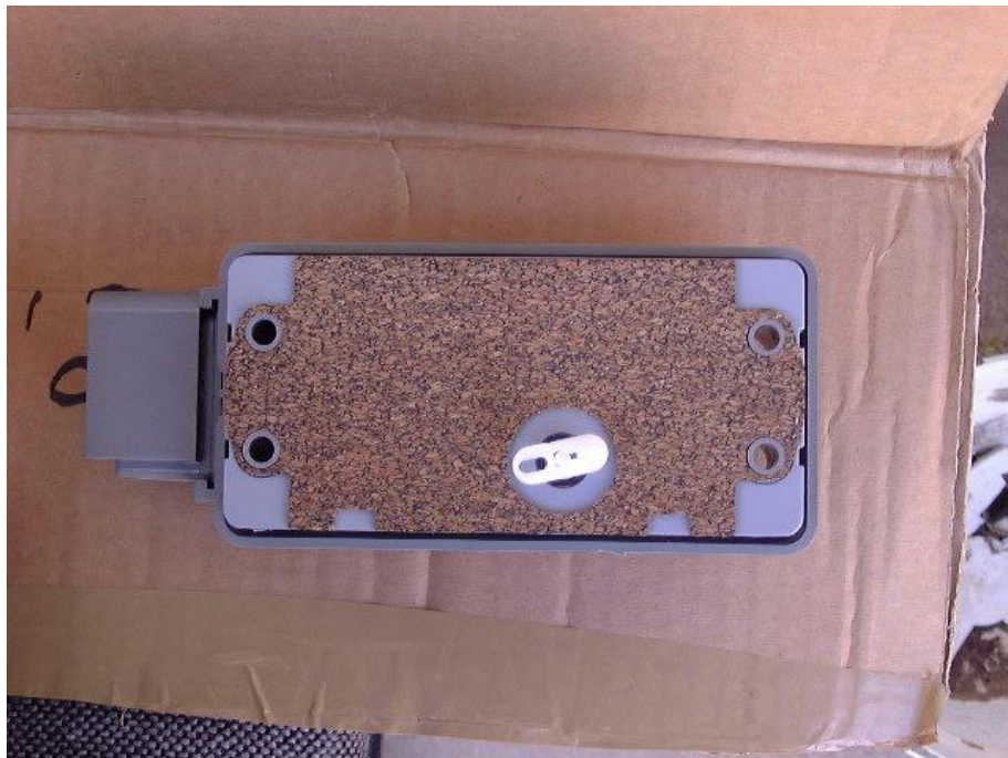
Figure 2 Housing Rear View