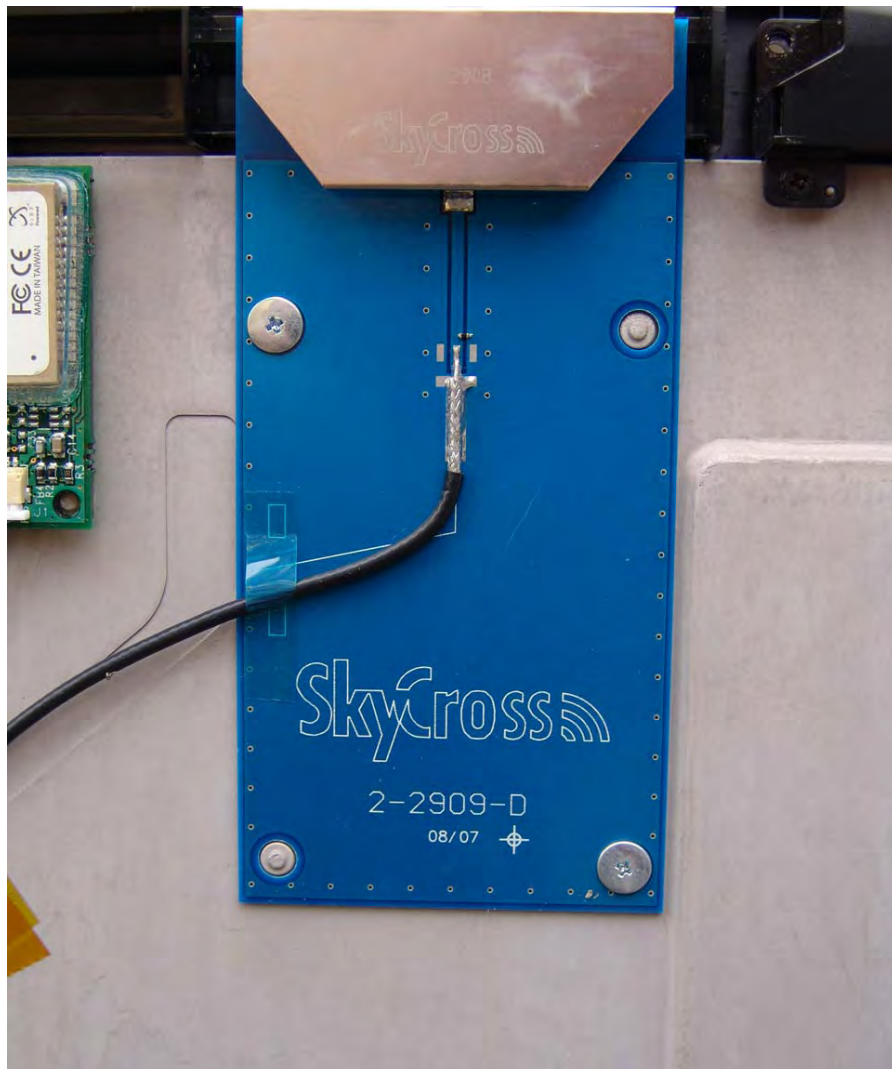
Co-Located WLAN, Inverted F antenna left and right