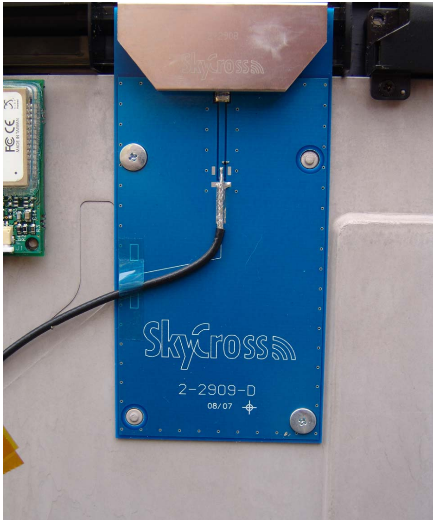
Co-Located WLAN, Inverted F antenna left and right