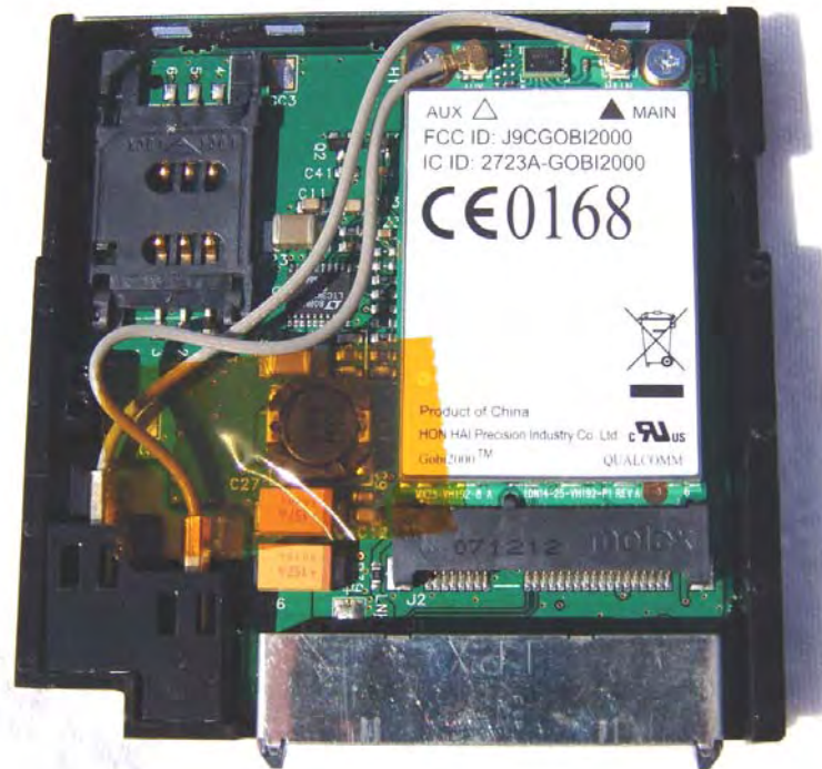
Top View of the IX-GOB12 CRMA pcb