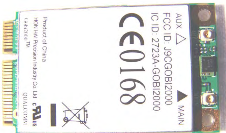
Bottom View of the J9CGB12000 with Shielding