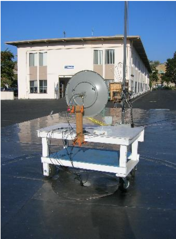
Laptop computer on other end of Ethernet Cable