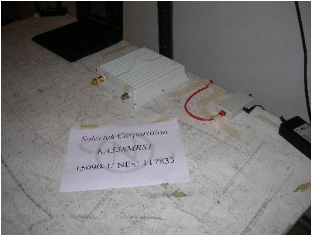
Investigated Conducted Emissions with and without antennas, without antennas is worst case.