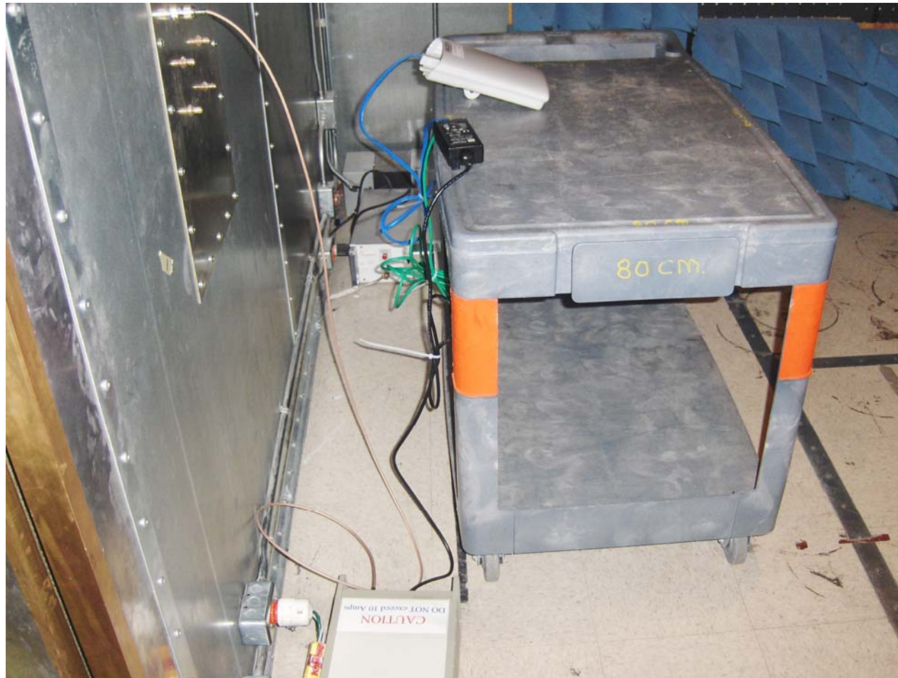
Plot #1: Test setup for AC Conducted Emissions