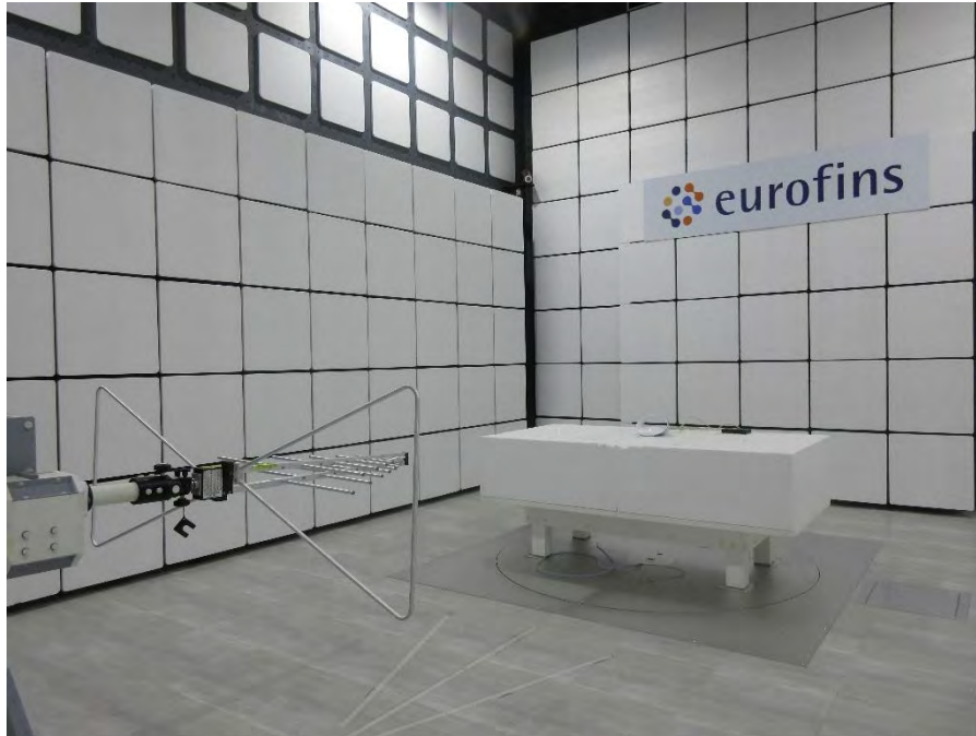
Below 1 GHz _ Rear View