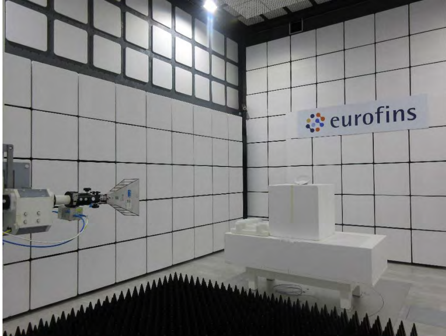
Above 1 GHz _ Rear View