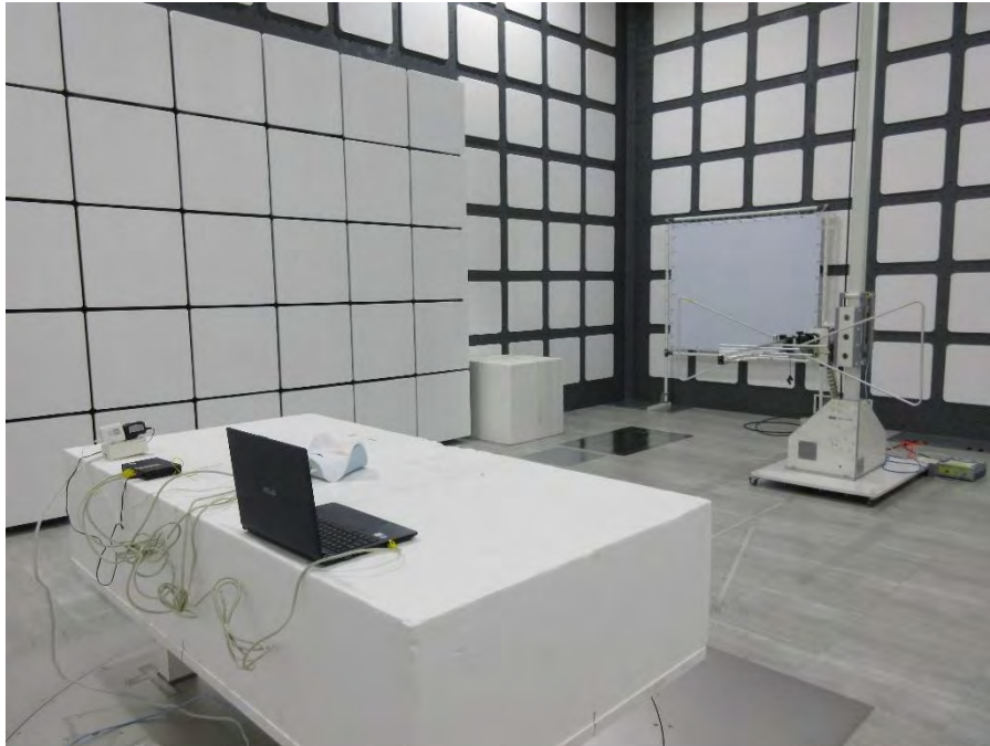
Below 1 GHz _ Rear View