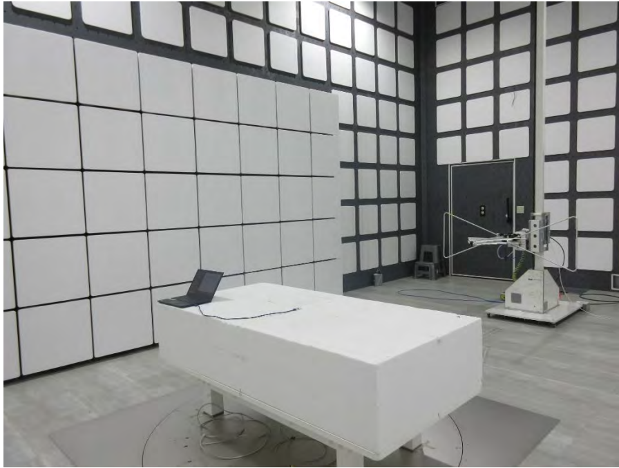
Below 1 GHz _ Rear View