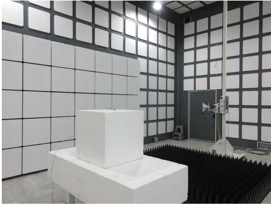
Above 1 GHz _ Rear View