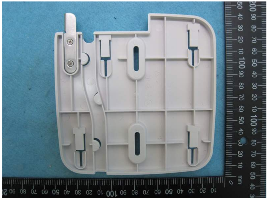
Adapter 1 Model No.: AMS9-1201000FU2