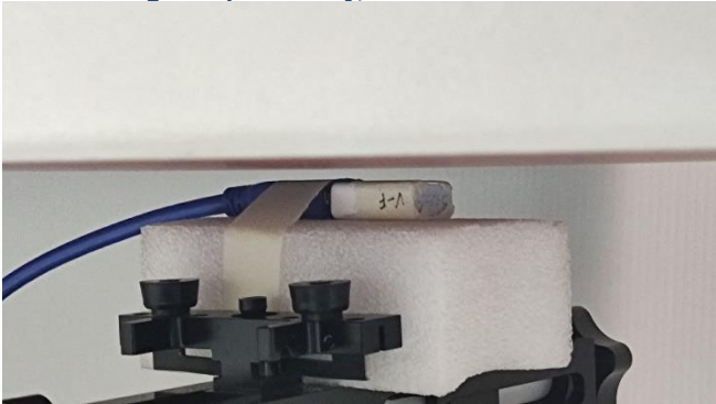
Testing Setup for Body, Horizontal-UP at 5 mm