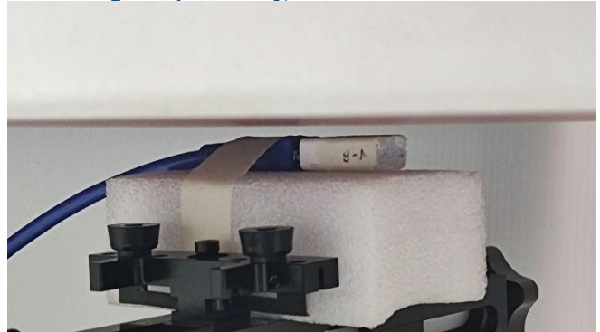
Testing Setup for Body, Horizontal-Down at 5 mm