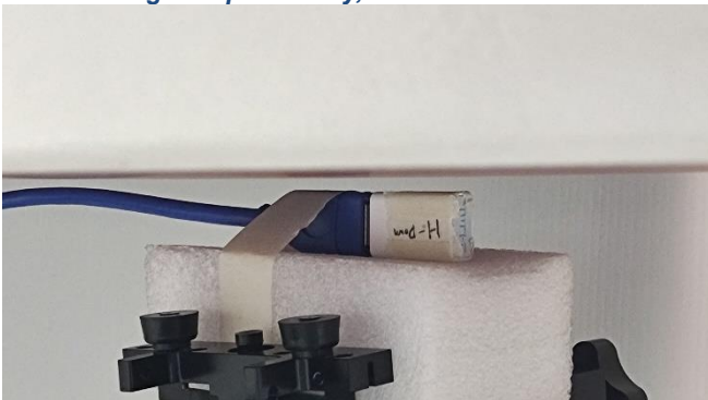
Testing Setup for Body, Vertical-Front at 5 mm