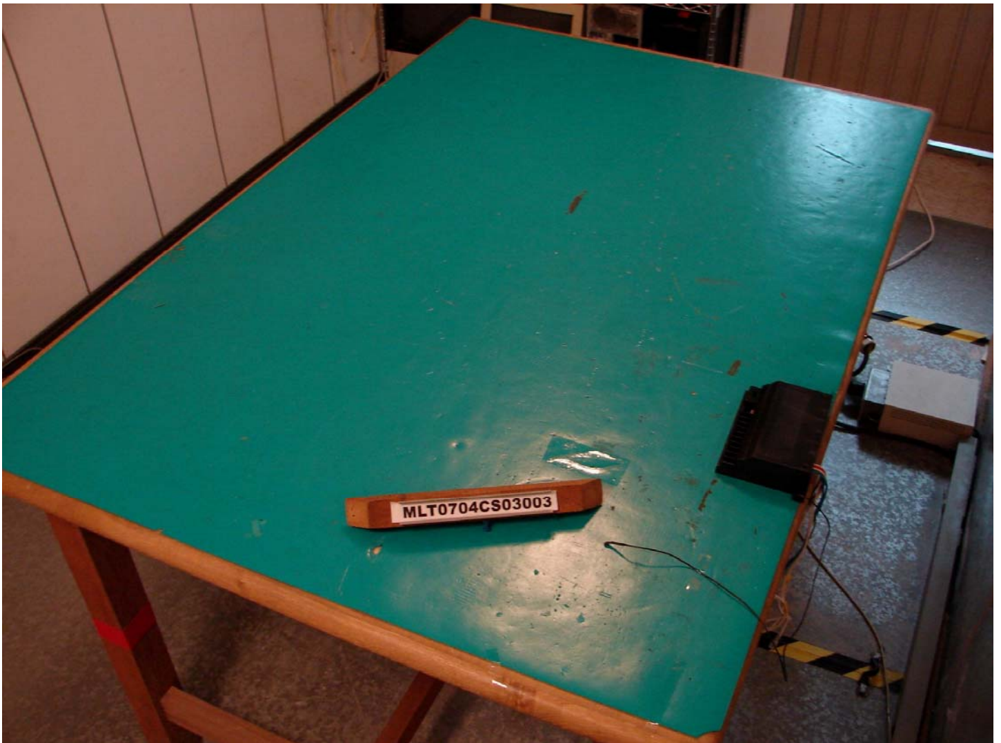
Rear View of The Test Configuration