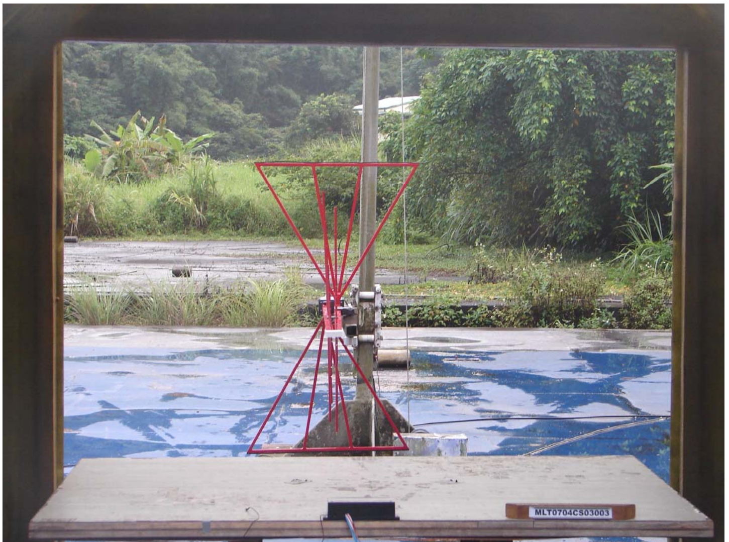
Rear View of The Test Configuration