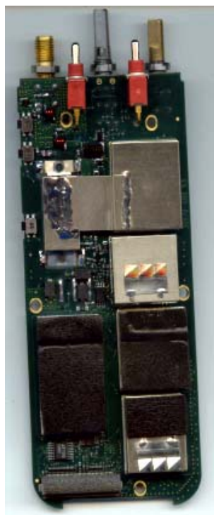
RF board bottom side.