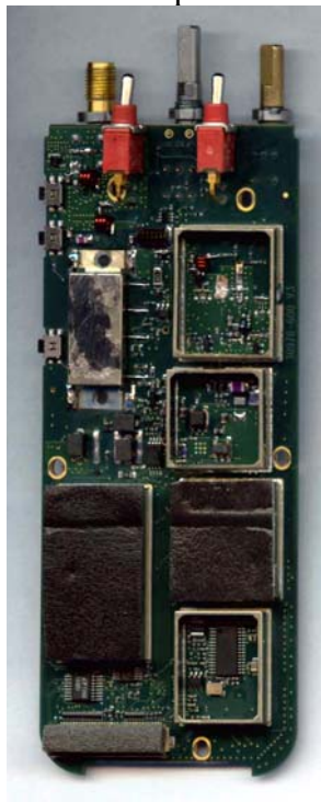
RF board top side