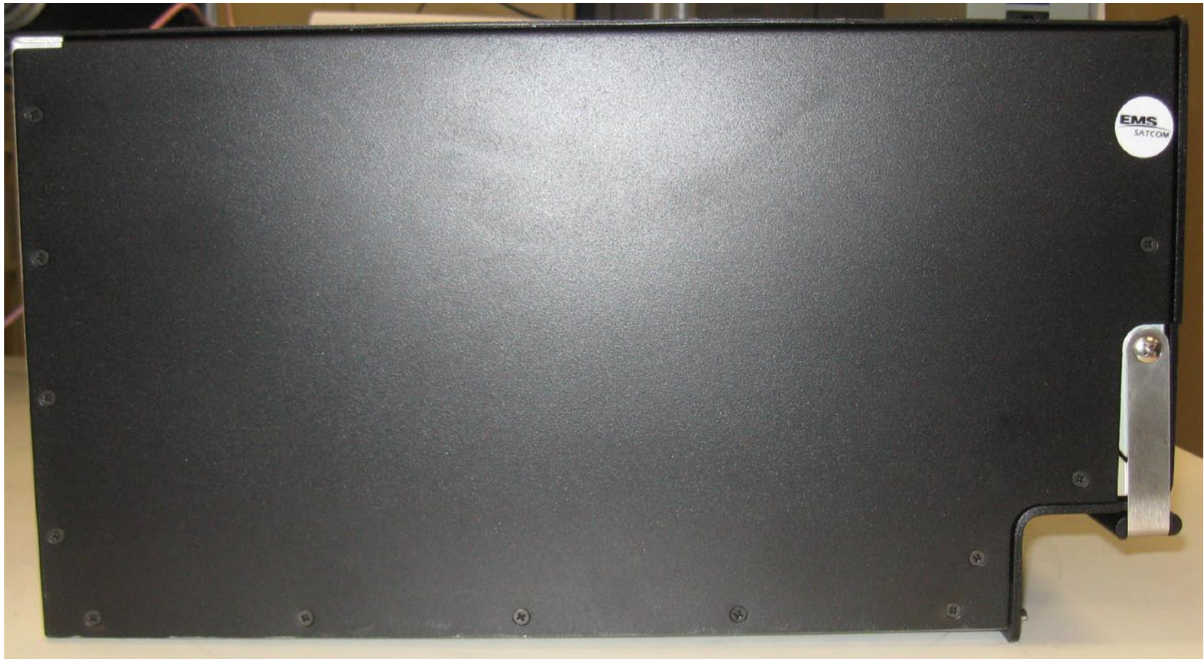
Figure 3: HSD MK2 Side View

CONFIDENTIAL, UNPUBLISHED PROPERTY OF ONE OR MORE OF THE FOLLOWING - EMS TECHNOLOGIES CANADA, LTD., FORMATION INC., SKY CONNECT LLC (COLLECTIVELY "EMS AVIATION").