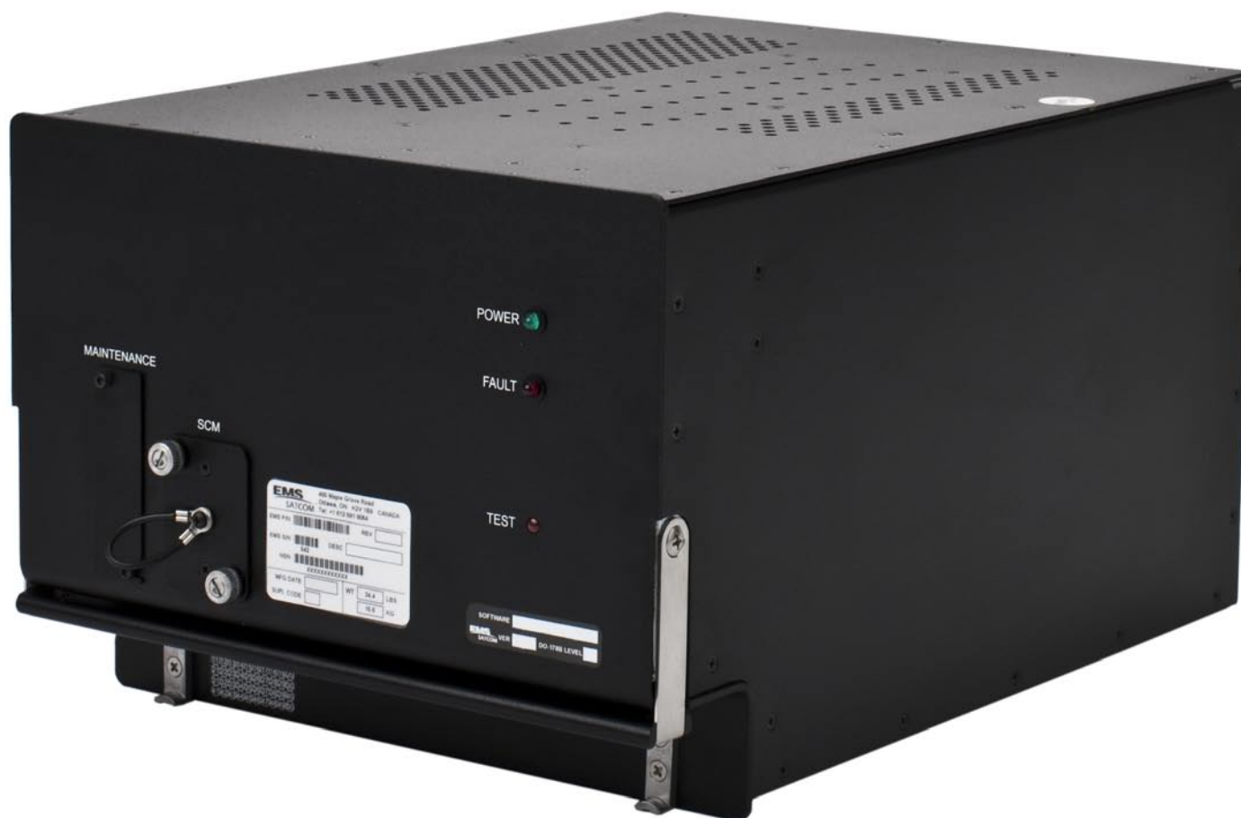
Figure 2: HSD MK2 Isometric View

CONFIDENTIAL, UNPUBLISHED PROPERTY OF ONE OR MORE OF THE FOLLOWING - EMS TECHNOLOGIES CANADA, LTD., FORMATION INC., SKY CONNECT LLC (COLLECTIVELY “EMS AVIATION”).