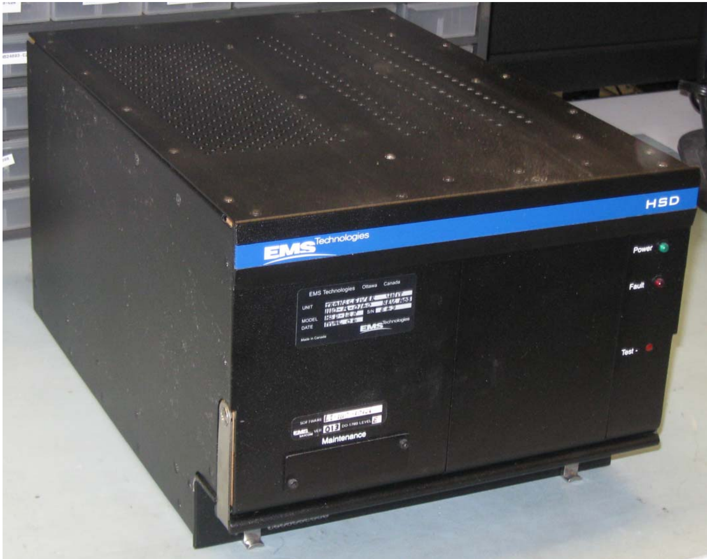
Figure 2: HSD-128 Isometric View

CONFIDENTIAL, UNPUBLISHED PROPERTY OF ONE OR MORE OF THE FOLLOWING - EMS TECHNOLOGIES CANADA, LTD., FORMATION INC., SKY CONNECT LLC (COLLECTIVELY “EMS AVIATION”).