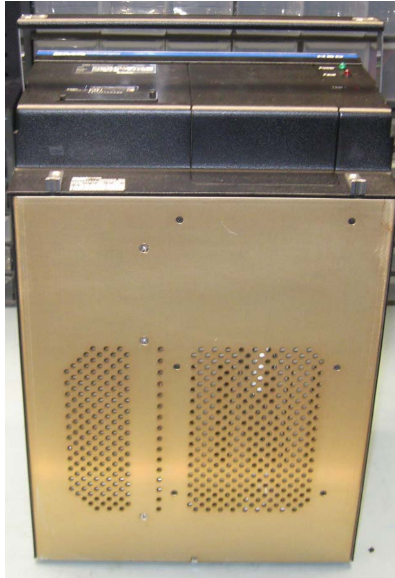
Figure 6: HSD-128 Bottom

CONFIDENTIAL, UNPUBLISHED PROPERTY OF ONE OR MORE OF THE FOLLOWING - EMS TECHNOLOGIES CANADA, LTD., FORMATION INC., SKY CONNECT LLC (COLLECTIVELY "EMS AVIATION").