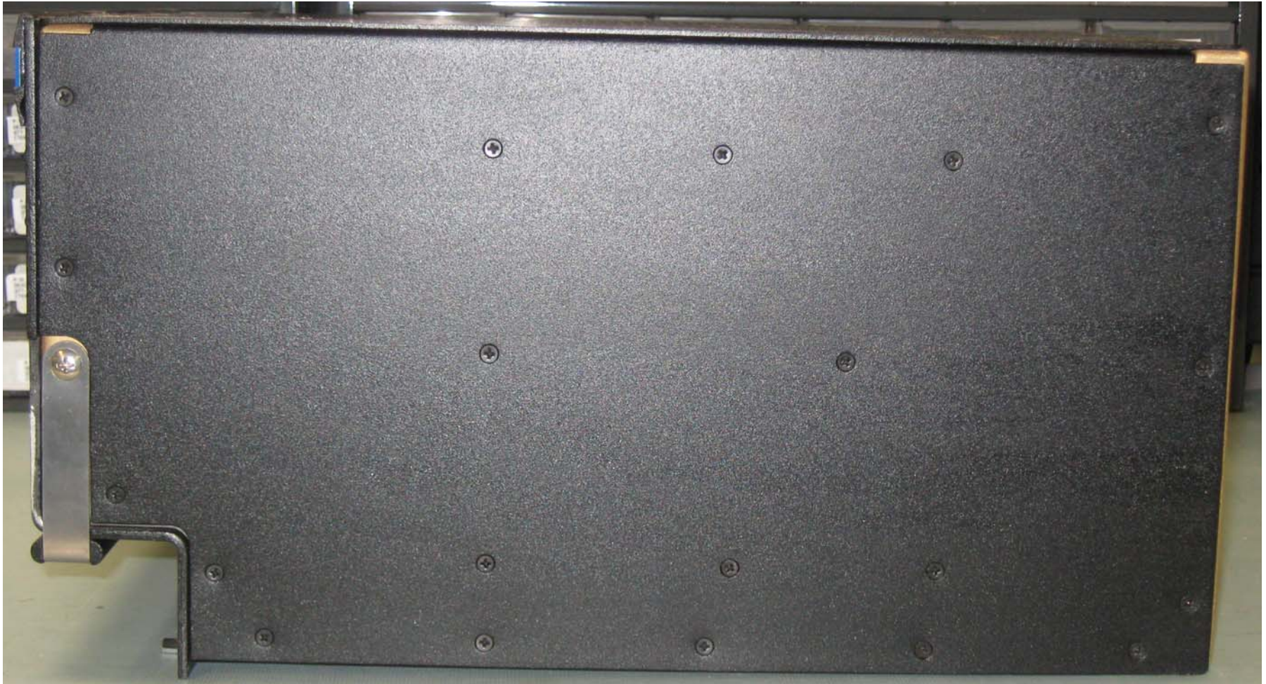
Figure 3: HSD-128 Side View

CONFIDENTIAL, UNPUBLISHED PROPERTY OF ONE OR MORE OF THE FOLLOWING - EMS TECHNOLOGIES CANADA, LTD., FORMATION INC., SKY CONNECT LLC (COLLECTIVELY “EMS AVIATION”).