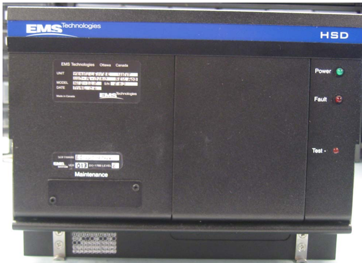
Figure 1: HSD-128 Front View

CONFIDENTIAL, UNPUBLISHED PROPERTY OF ONE OR MORE OF THE FOLLOWING - EMS TECHNOLOGIES CANADA, LTD., FORMATION INC., SKY CONNECT LLC (COLLECTIVELY “EMS AVIATION”).