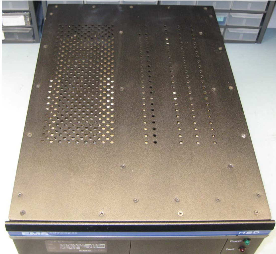
Figure 4: HSD-128 Top View

CONFIDENTIAL, UNPUBLISHED PROPERTY OF ONE OR MORE OF THE FOLLOWING - EMS TECHNOLOGIES CANADA, LTD., FORMATION INC., SKY CONNECT LLC (COLLECTIVELY “EMS AVIATION”).