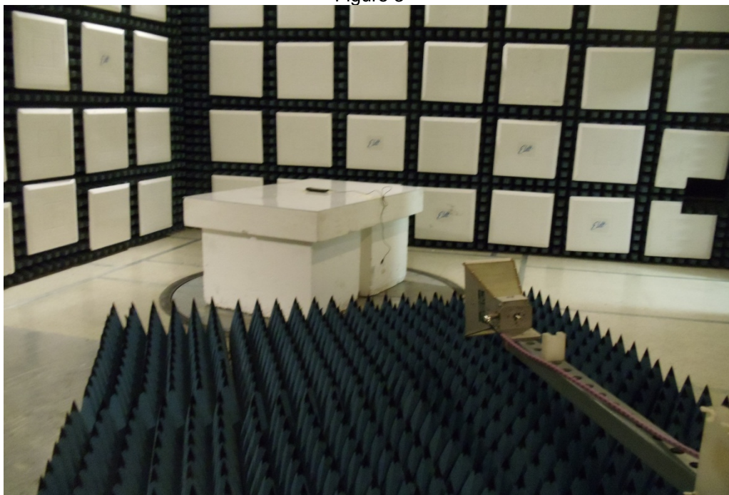
Test Setup for Radiated Emissions, above 1GHz – Horizontal Polarization