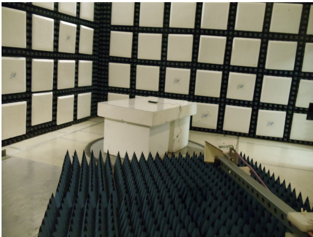
Test Setup for Radiated Emissions above 1GHz – Vertical Polarization