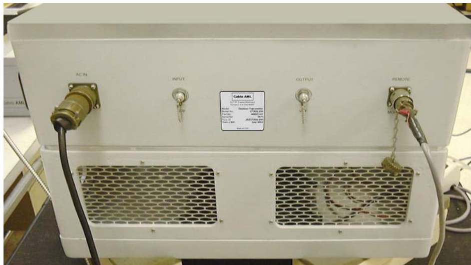
Figure 8. Outside Lower Panel ID Label Location.