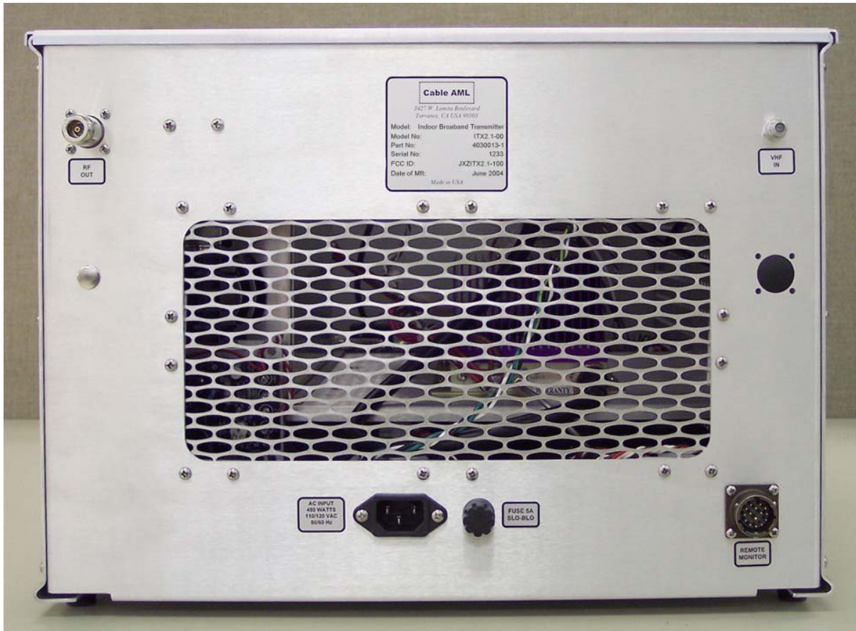
Figure 8. Outside ID Label Location.