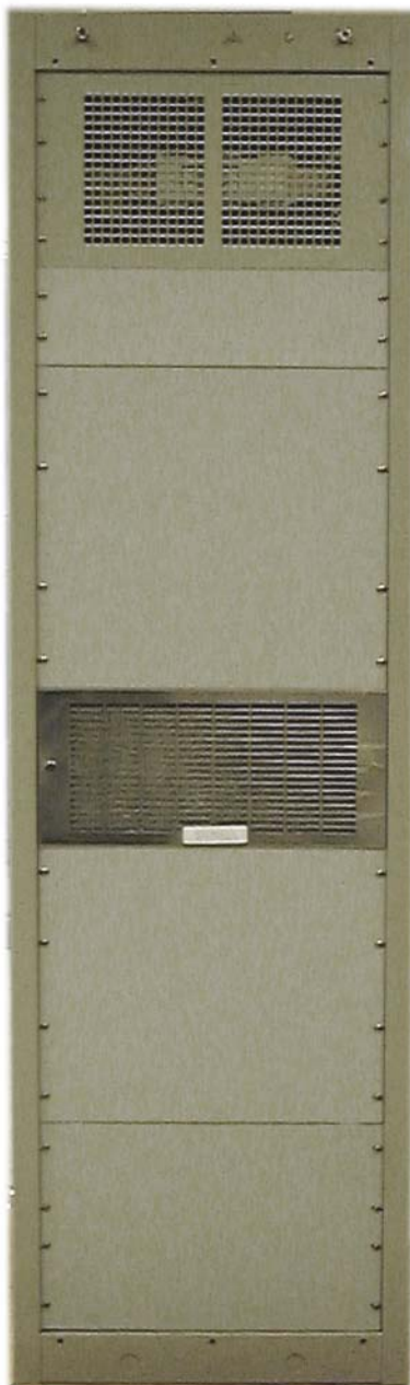
Figure 4. ITX02-2000 Broadband Transmitter (Rear).