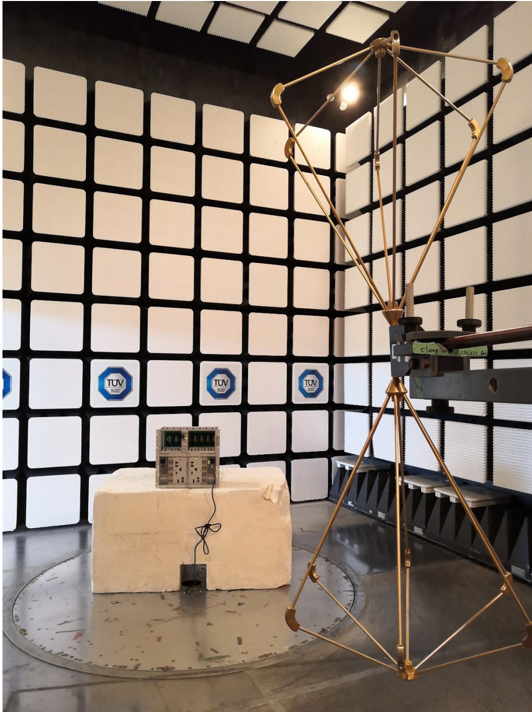
Figure 1 – Radiated Emissions Setup – Photo 1