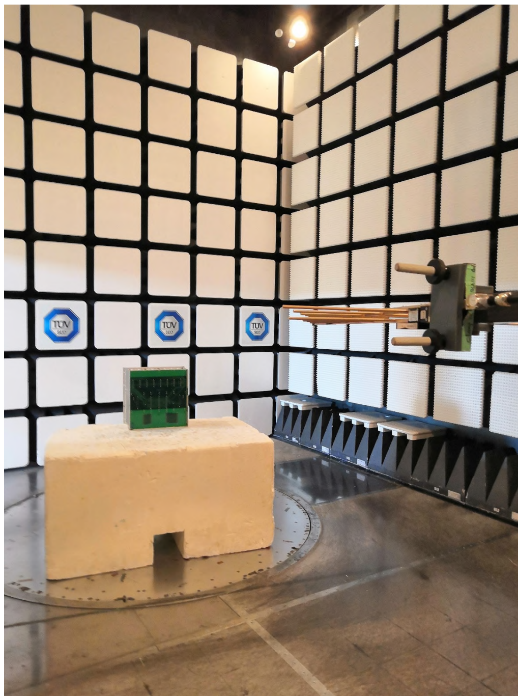
Figure 2 – Radiated Emissions Setup – Photo 2