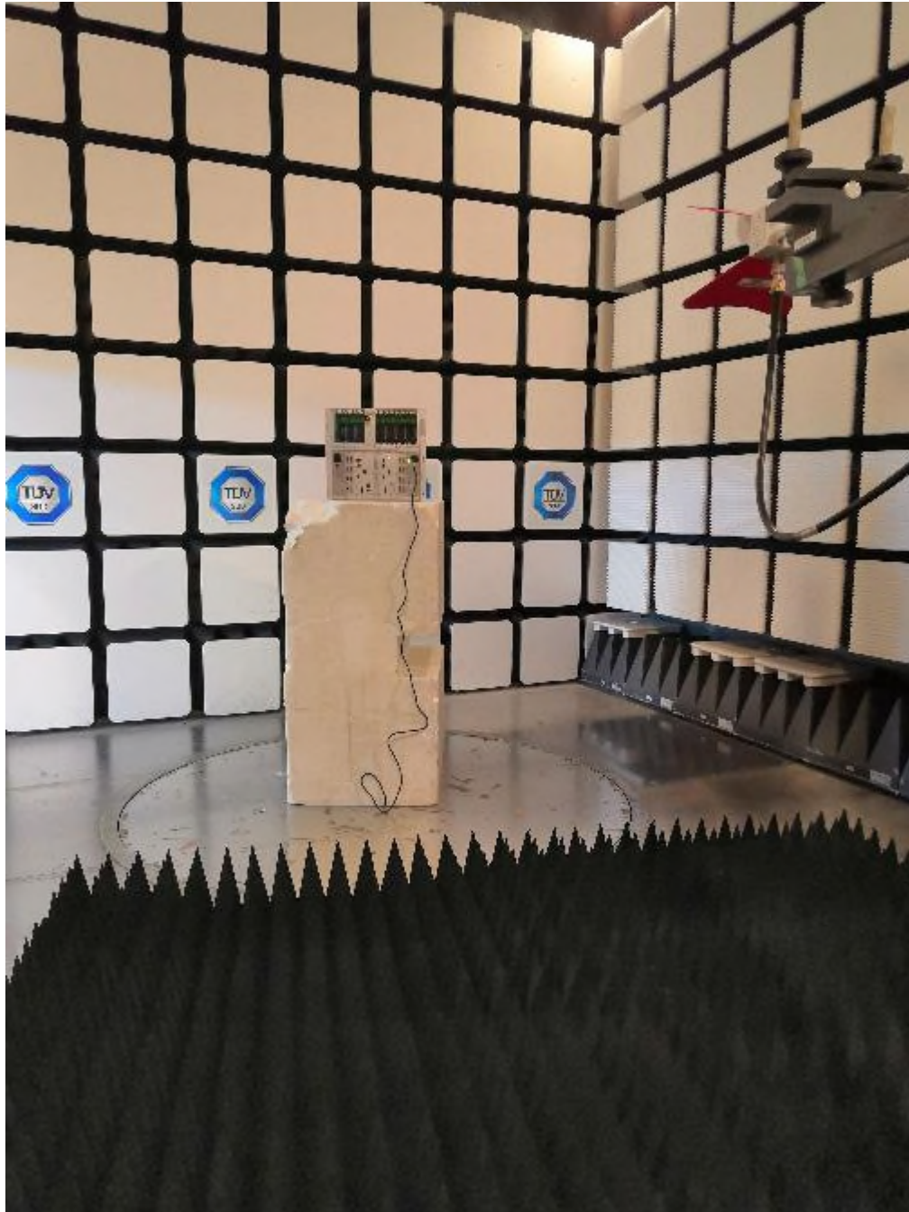
Figure 3 – Radiated Emissions Setup – Photo 3