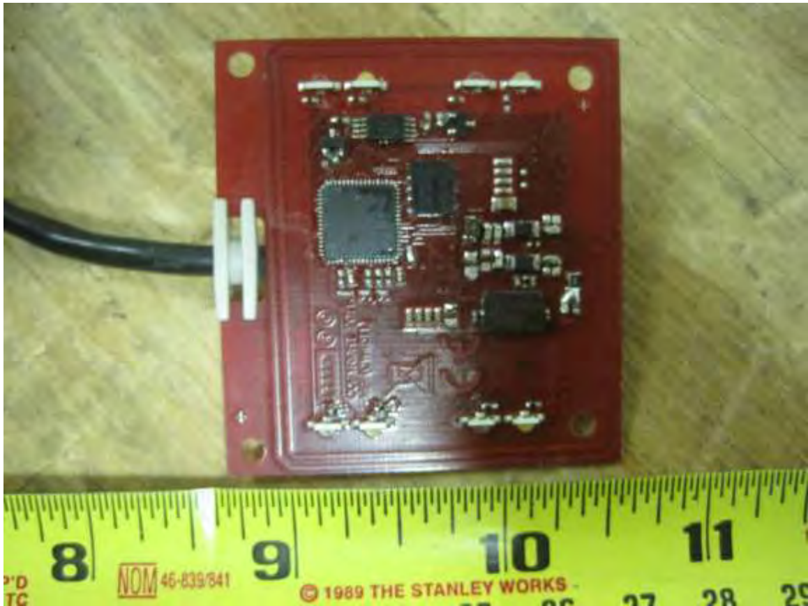
EUT radio board bottom View