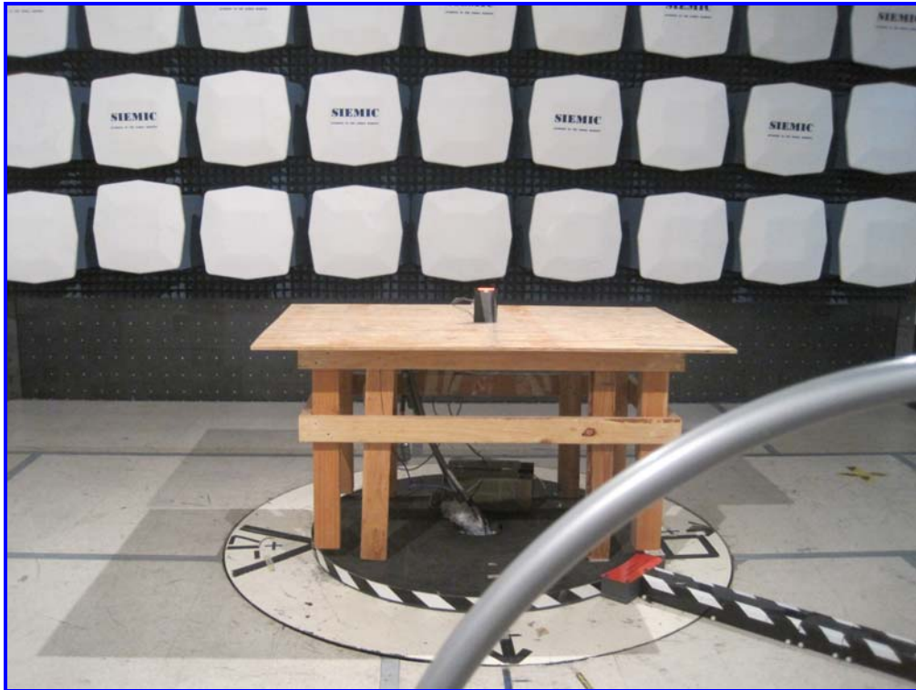
Radiated Emission (<30MHz) – Front View