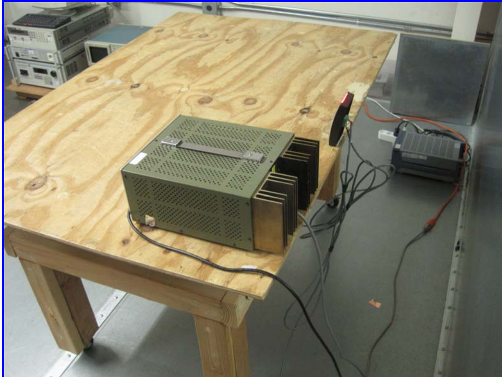
DC Line Conducted Emission - Front View