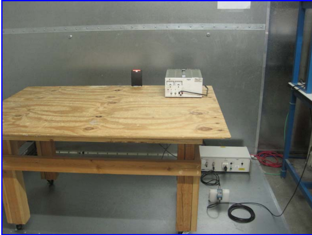
DC Line Conducted Emission - Front View