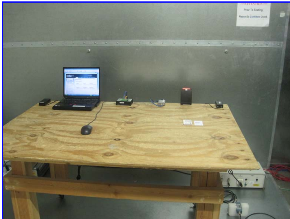
AC Line Conducted Emission - Front View