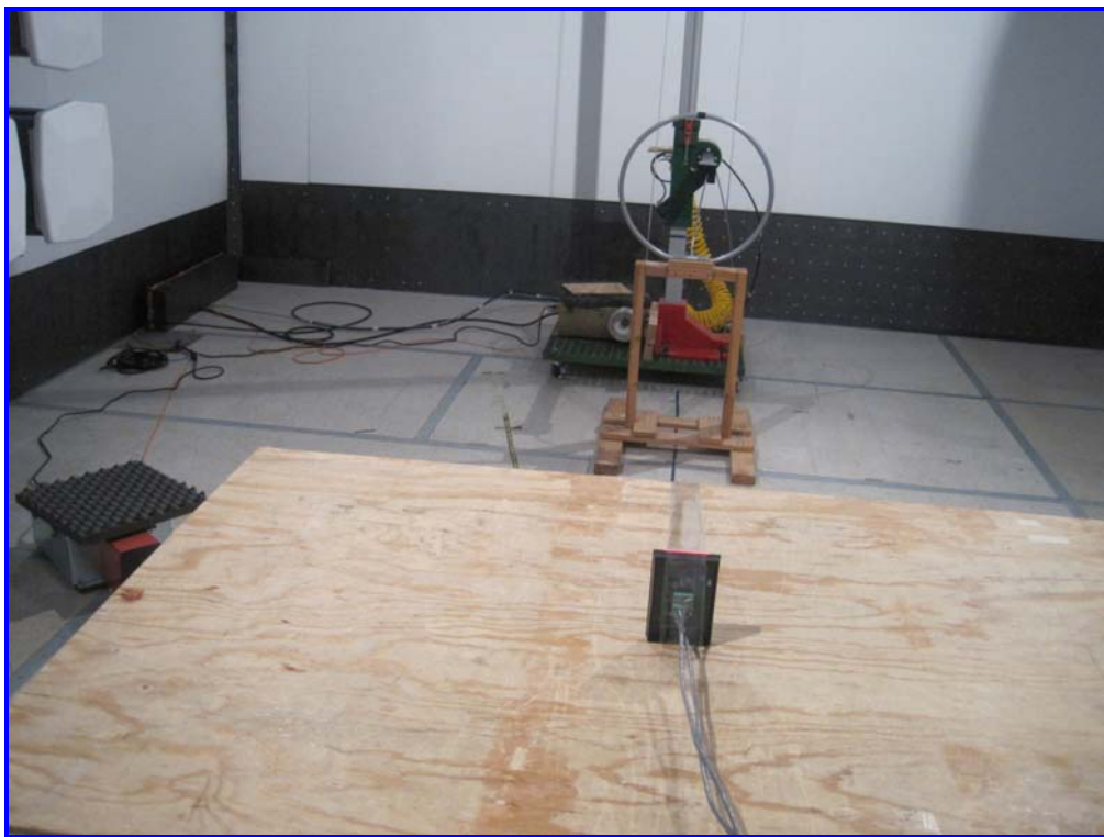
Radiated Emission (<30MHz) – Rear View