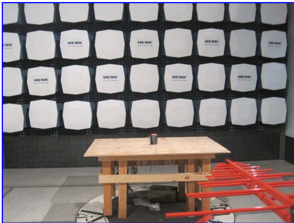
Radiated Emission (>30MHz) – Front View