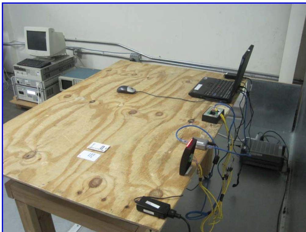
AC Line Conducted Emission - Front View