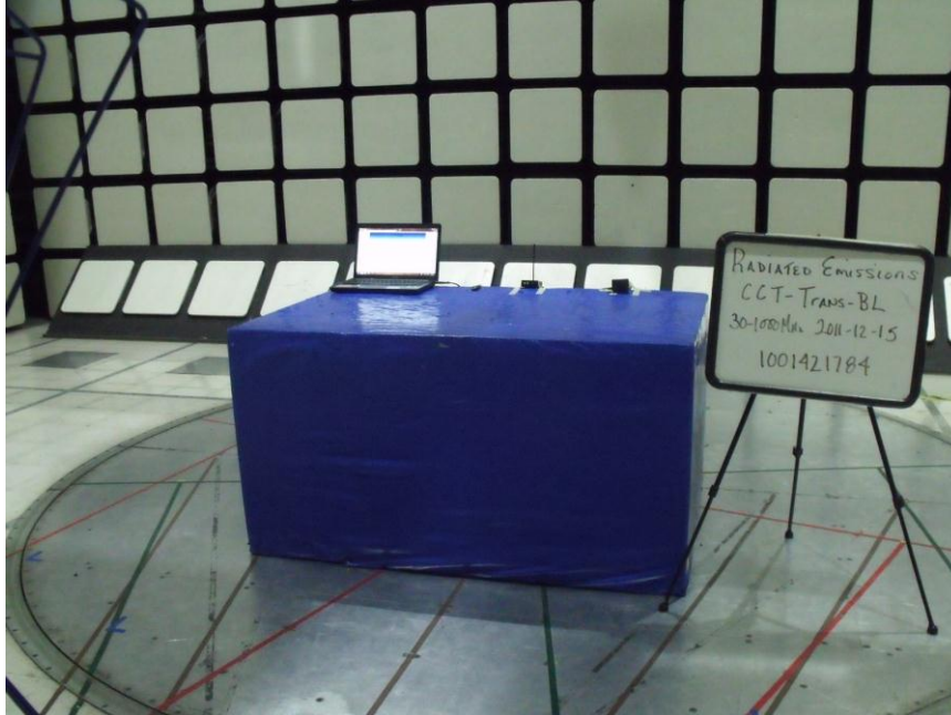
RADIATED EMISSIONS ABOVE 30 MHz (FRONT)