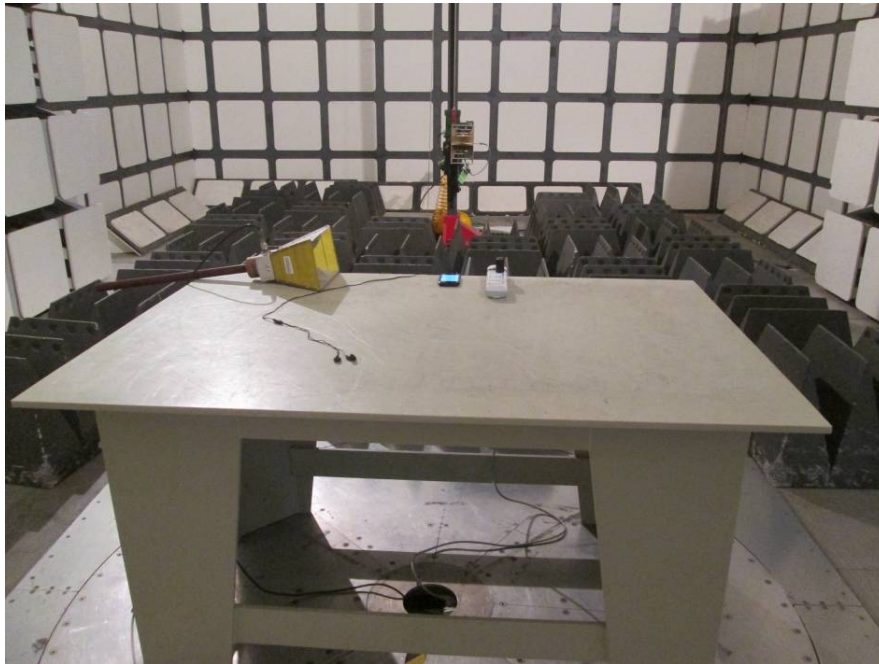
Radiated Emissions Rear View (1-25 GHz)