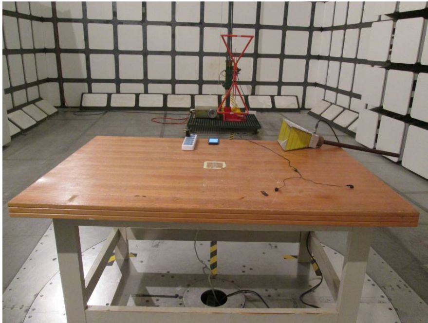
Radiated Emissions Rear View (30-1000 MHz)