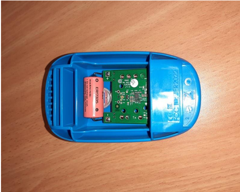
Photograph No.1 Actuator shut off unit internal view