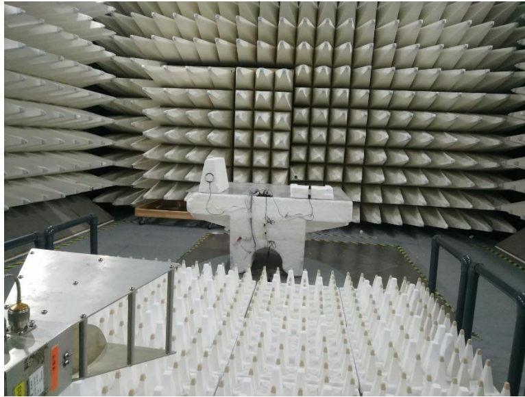
Photograph No.1 Setup for OBW, band edge emission and hopping parameters measurements