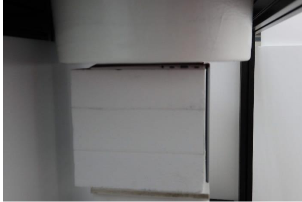
Bottom of Laptop at 0 mm