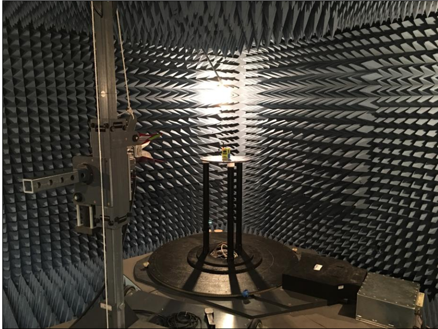
Photograph 3. Radiated Spurious Emissions, Test Setup, Above 1 GHz