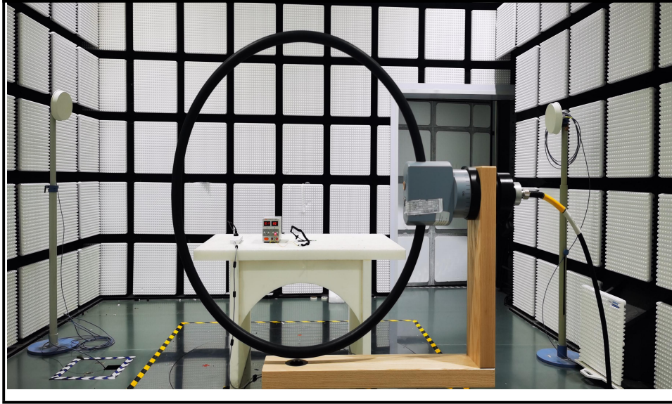
Fig. 1 Radiated emission setup photo(Below 30MHz)