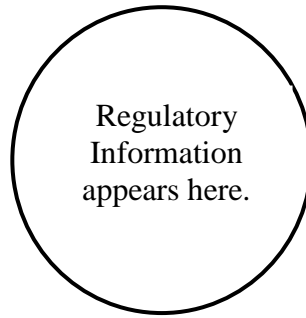
Figure 1.3.2. Location of FCC Label (position, orientation, and other information shown may vary).

Please note that this label and its placement complies with the requirement of FCC Rule 47 CFR 2.925(d) that the label be permanently affixed to the product, and be readily visible to the purchaser at the time of purchase.