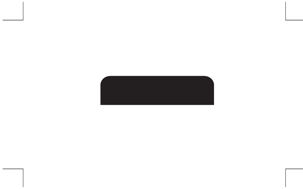
LABEL PANTONE 425 C PROCESS: 1ST SURFACE PRINTED ON TRANSPARENT LABEL