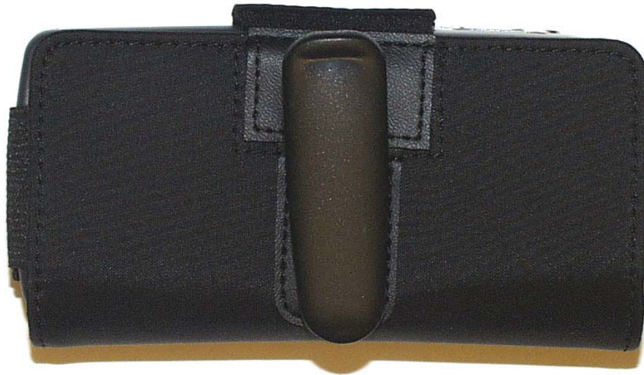
Figure 3. Phone in case; back view