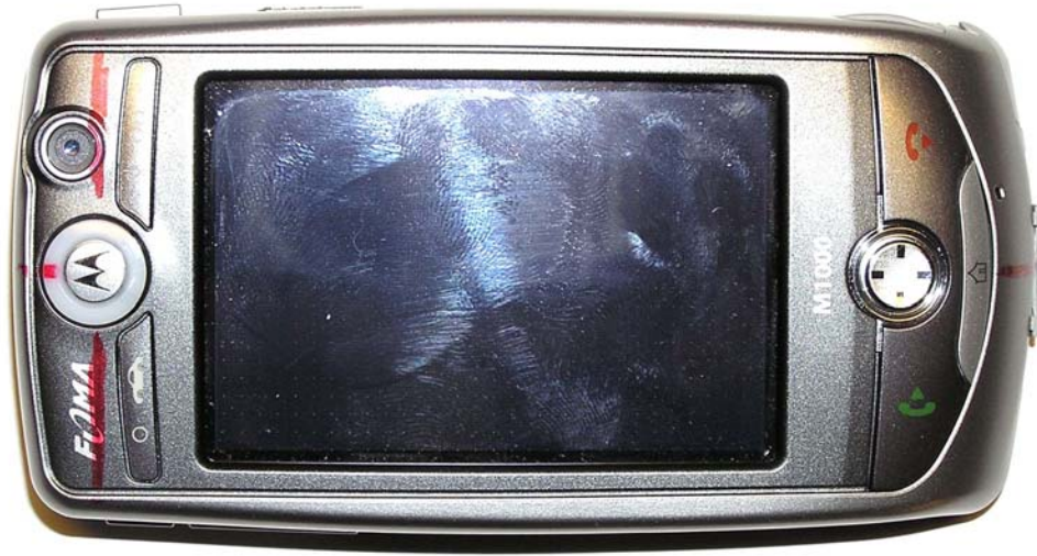
Figure 1. Front of Phone