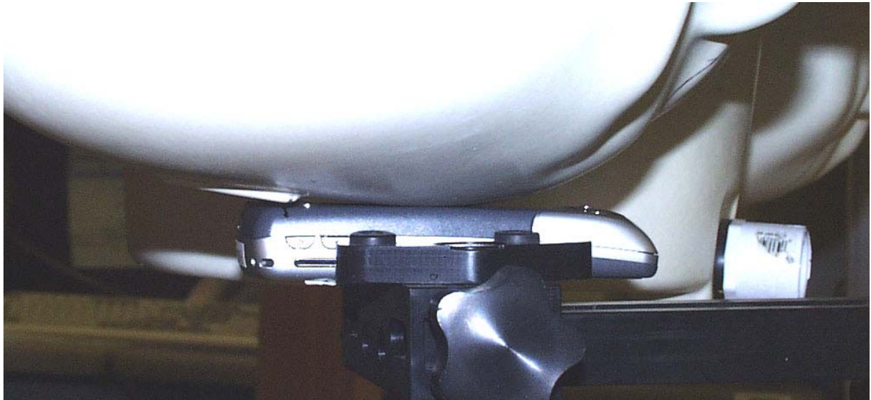
Figure 5. Check/Touch Position