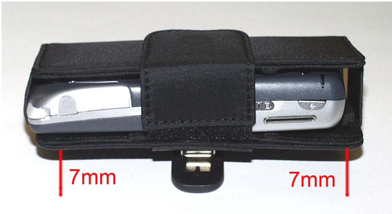
Figure 4. Phone in case; side view