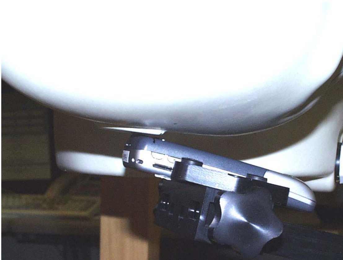
Figure 6. Tilt Position