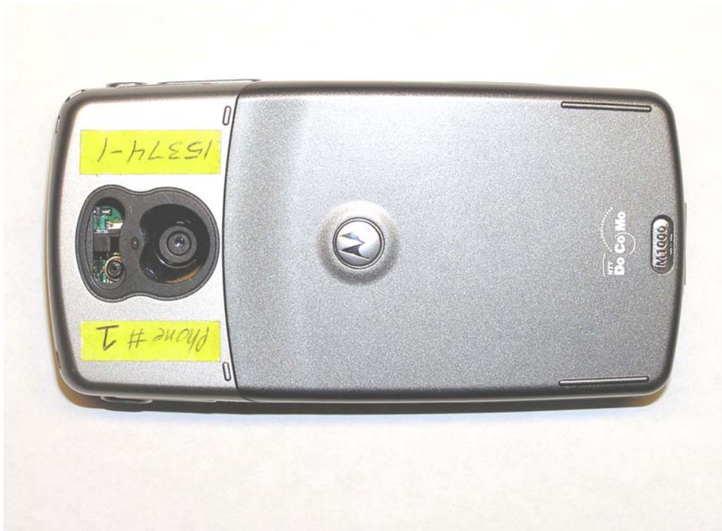
Figure 2. Back of Phone